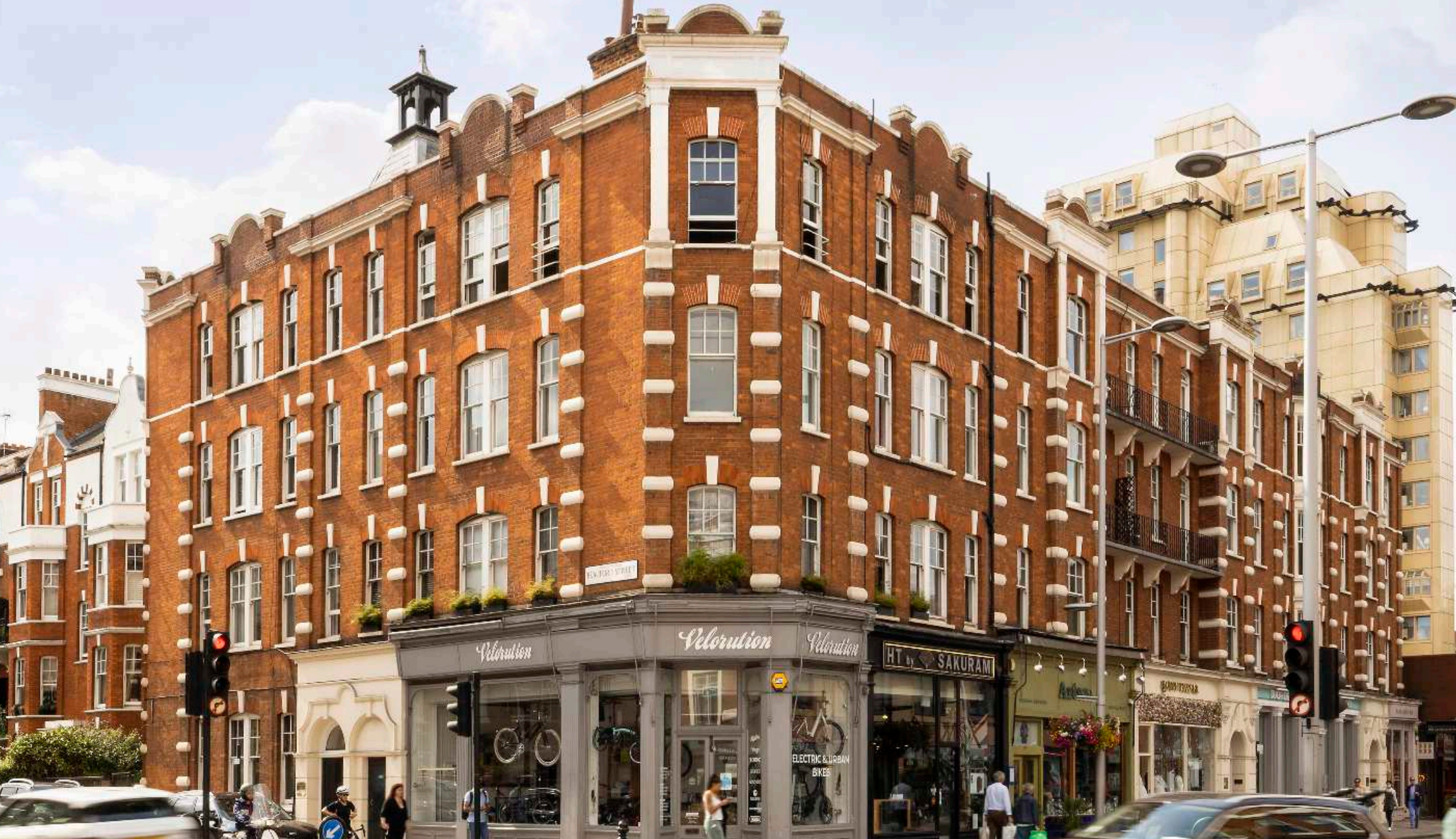
Alexandra Mansions, Chelsea SW3