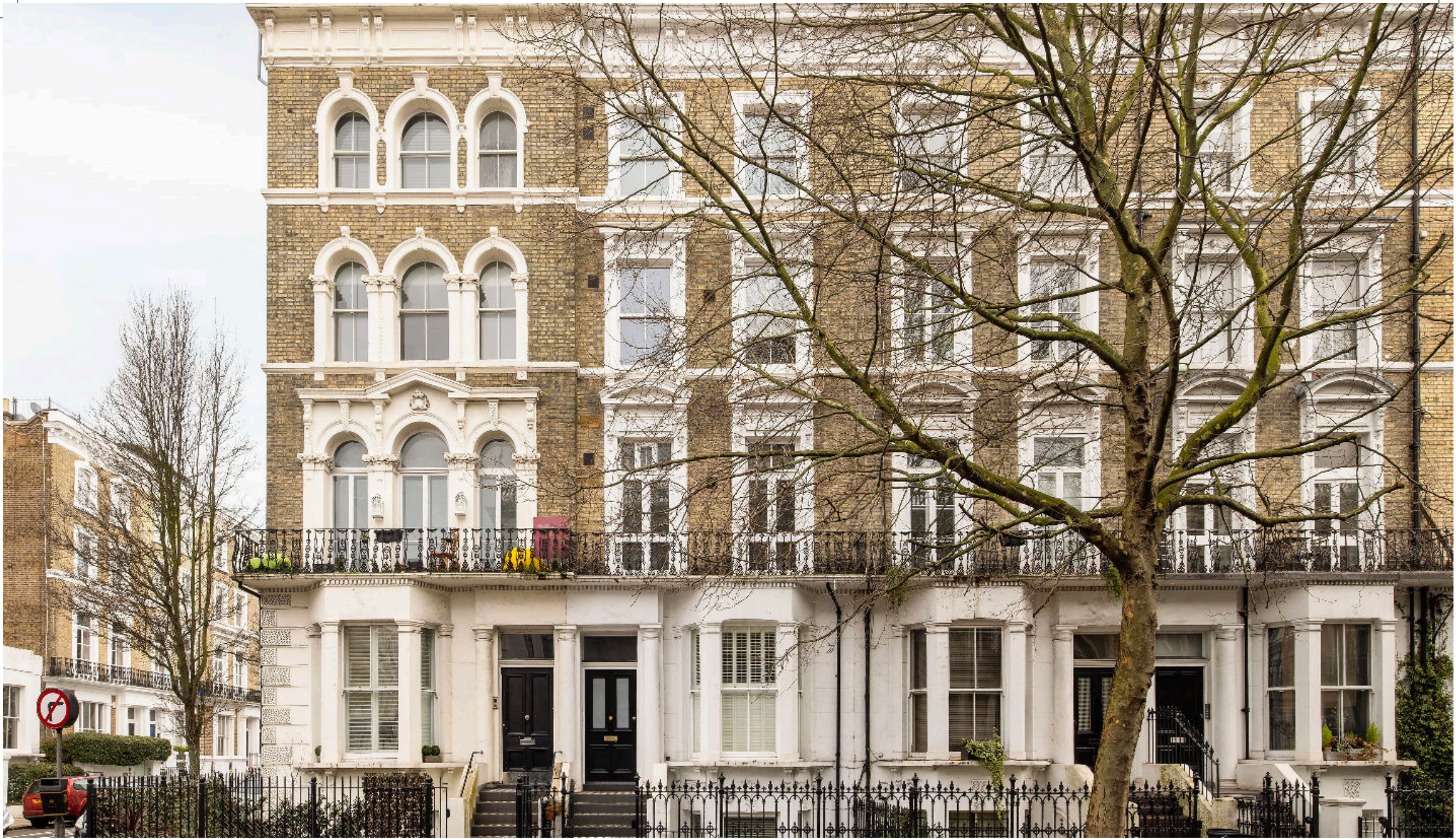
Finborough Road, London SW10