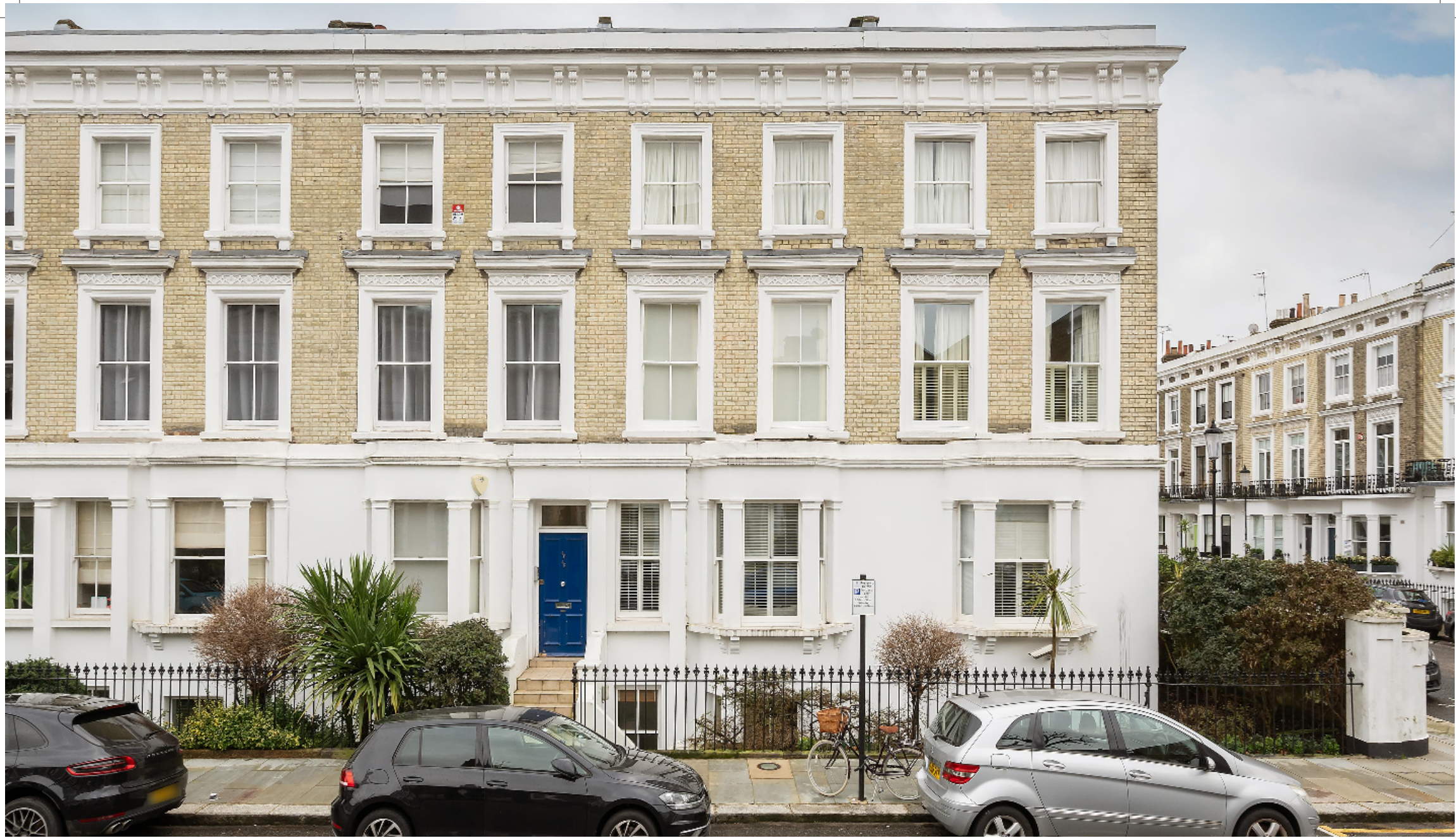
Gertrude Street, London SW10