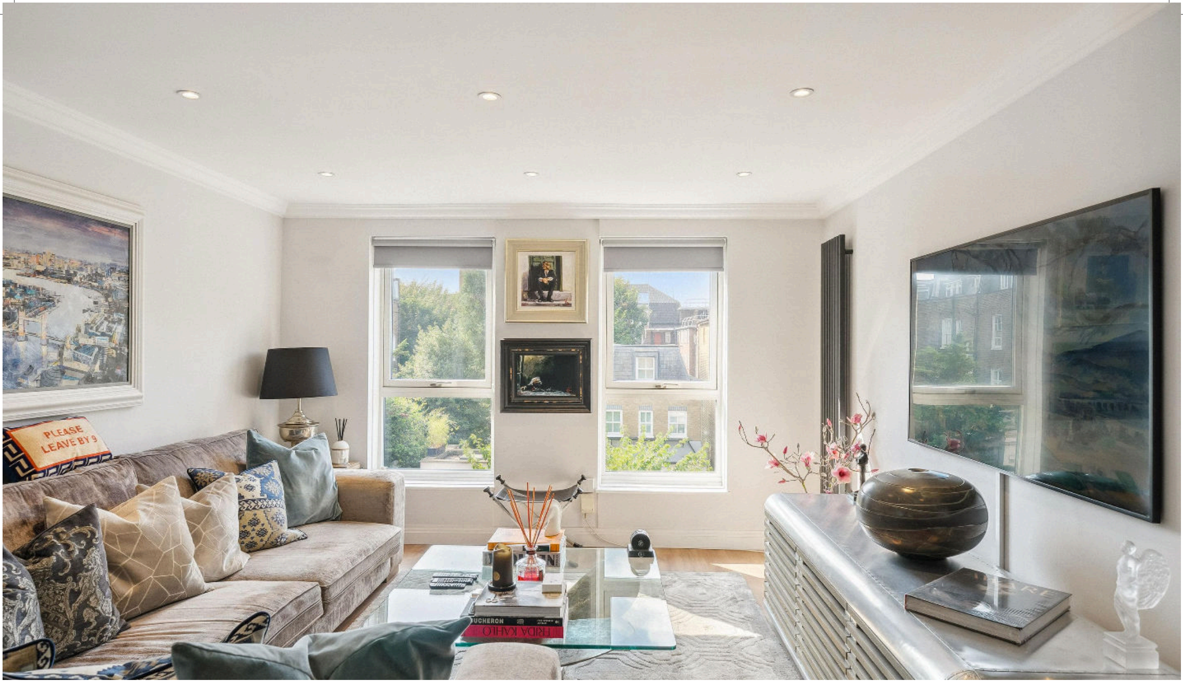
Edith Terrace, London SW10