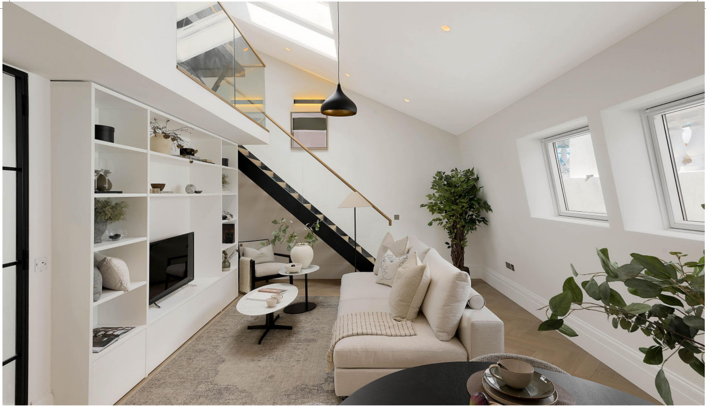
Redcliffe Gardens, London SW10