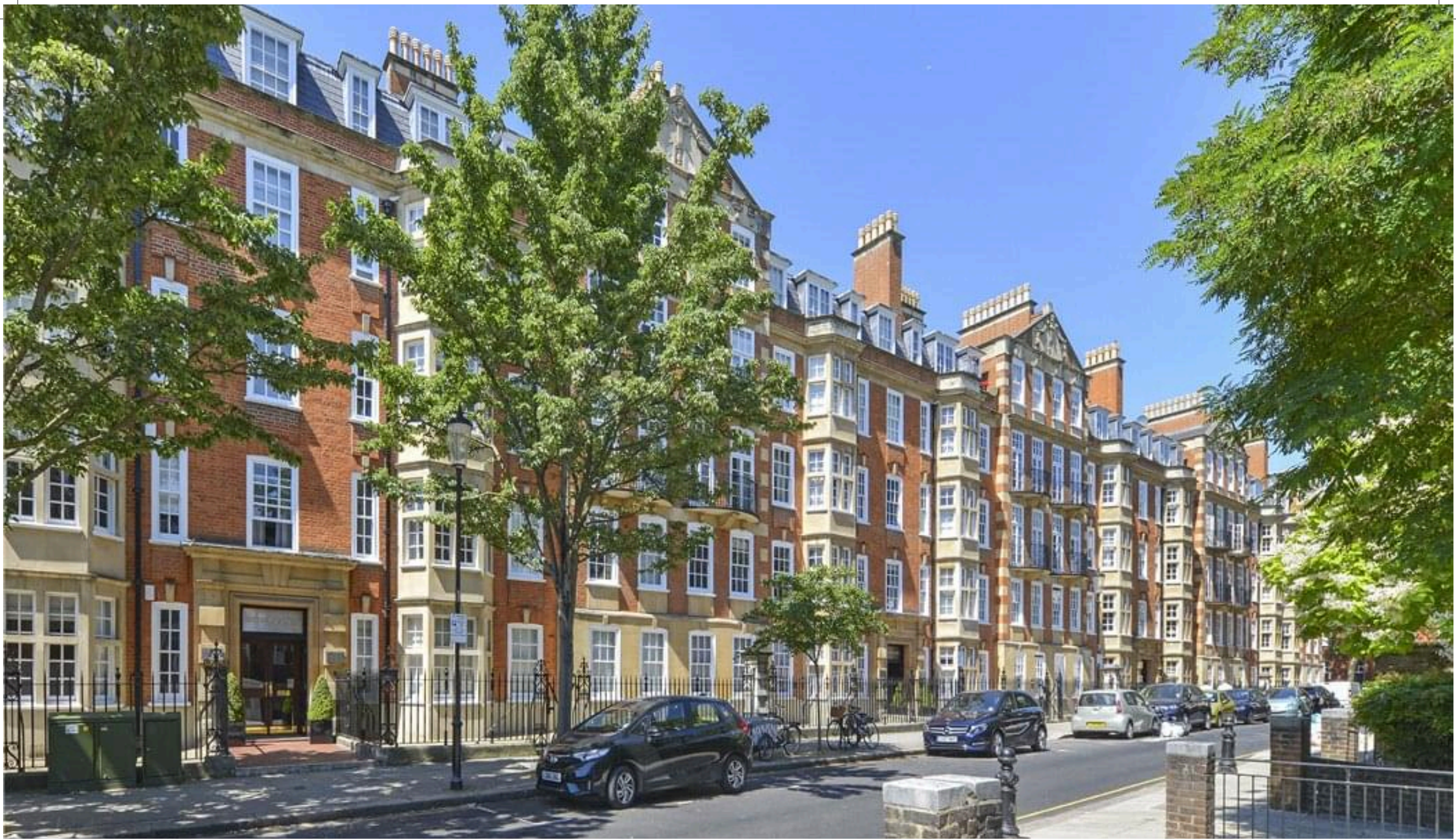
Coleherne Court, The Little Boltons, Chelsea SW5