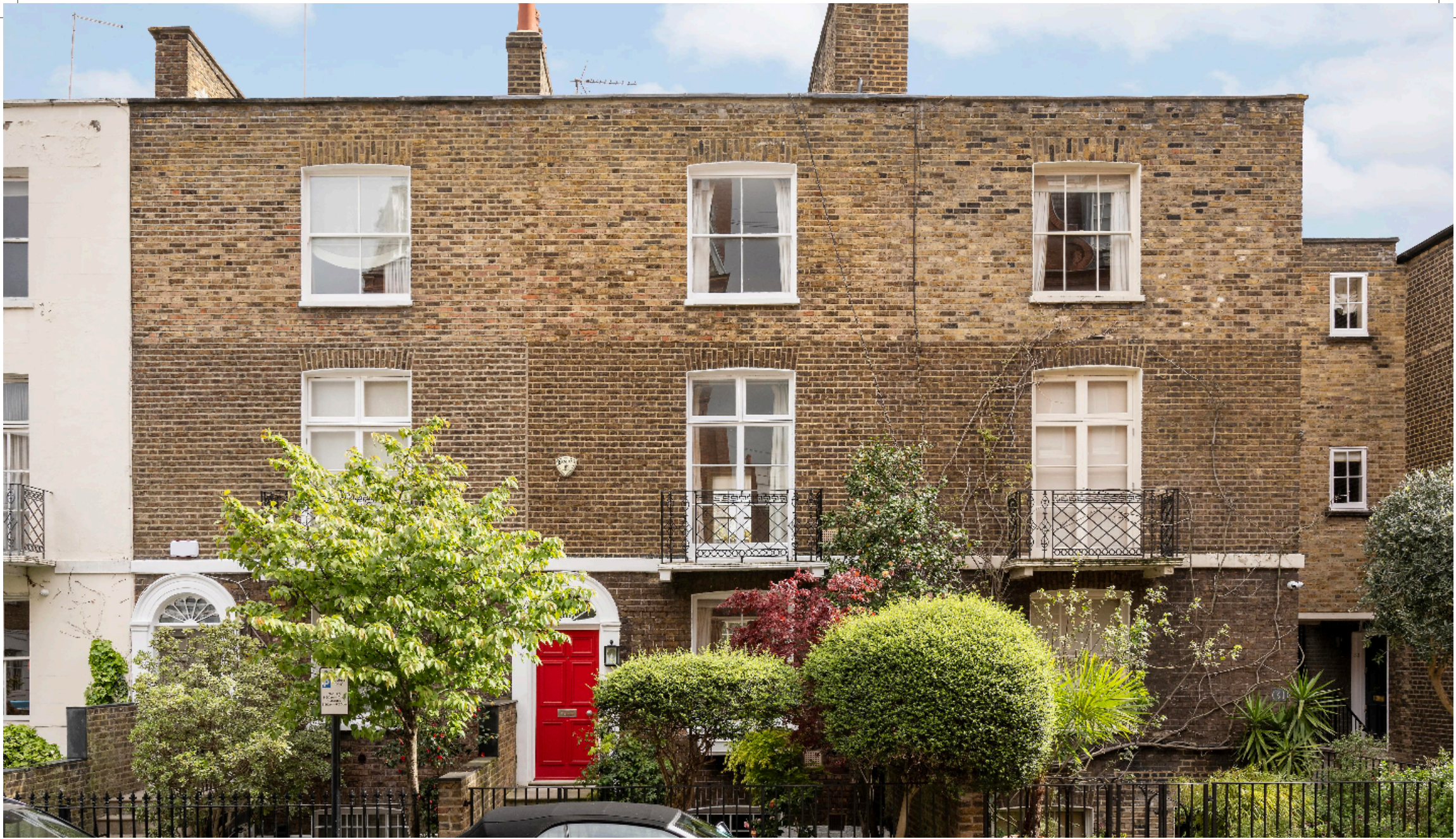
Park Walk, Chelsea SW10