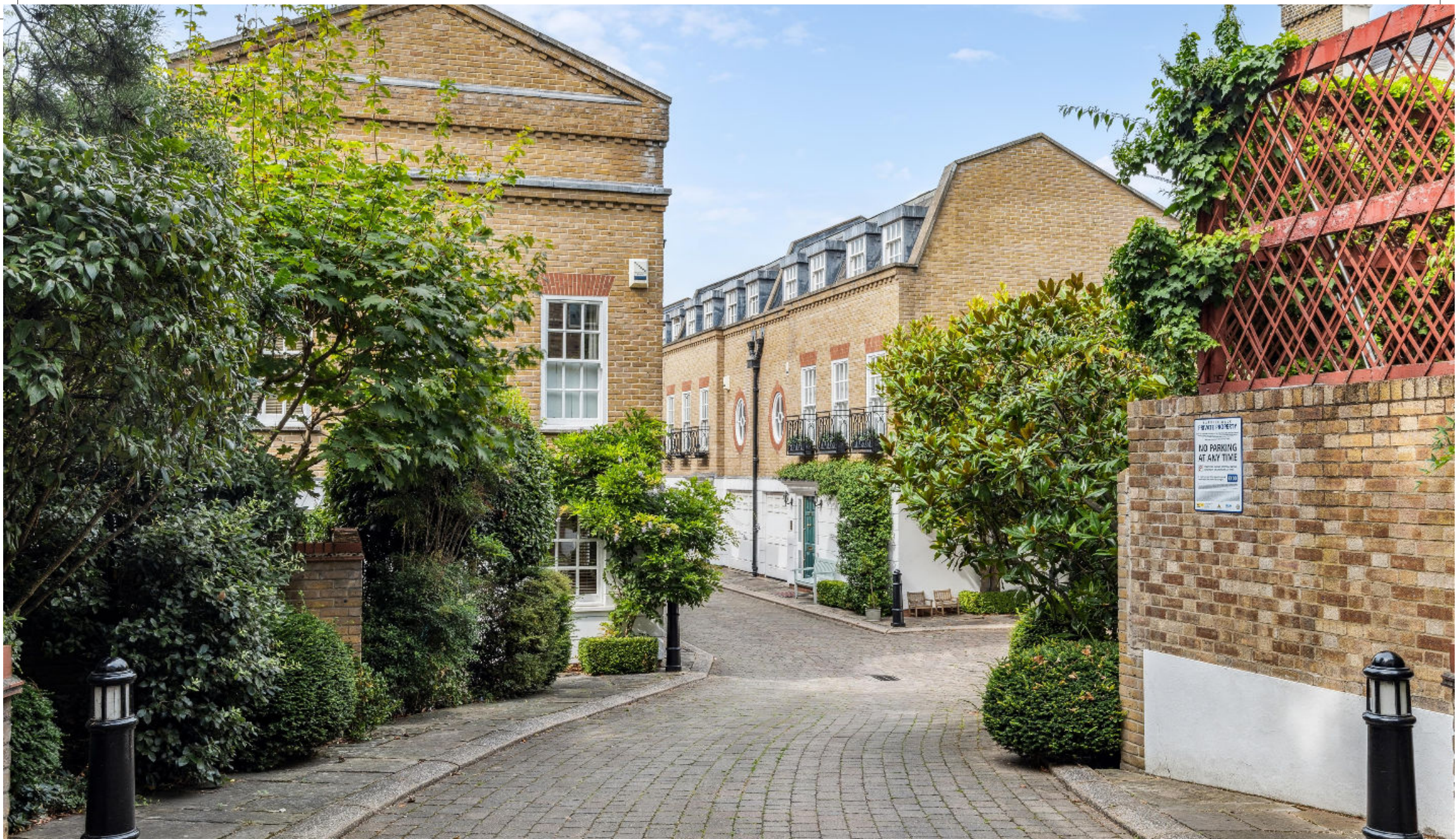
Farrier Walk, London SW10