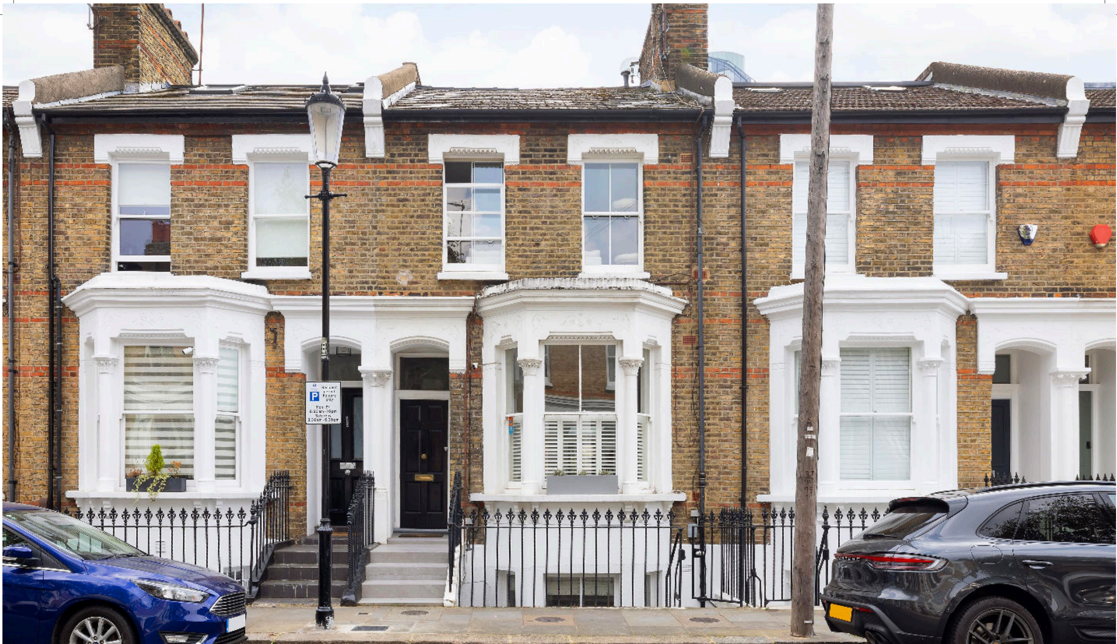
Burnaby Street, London SW10