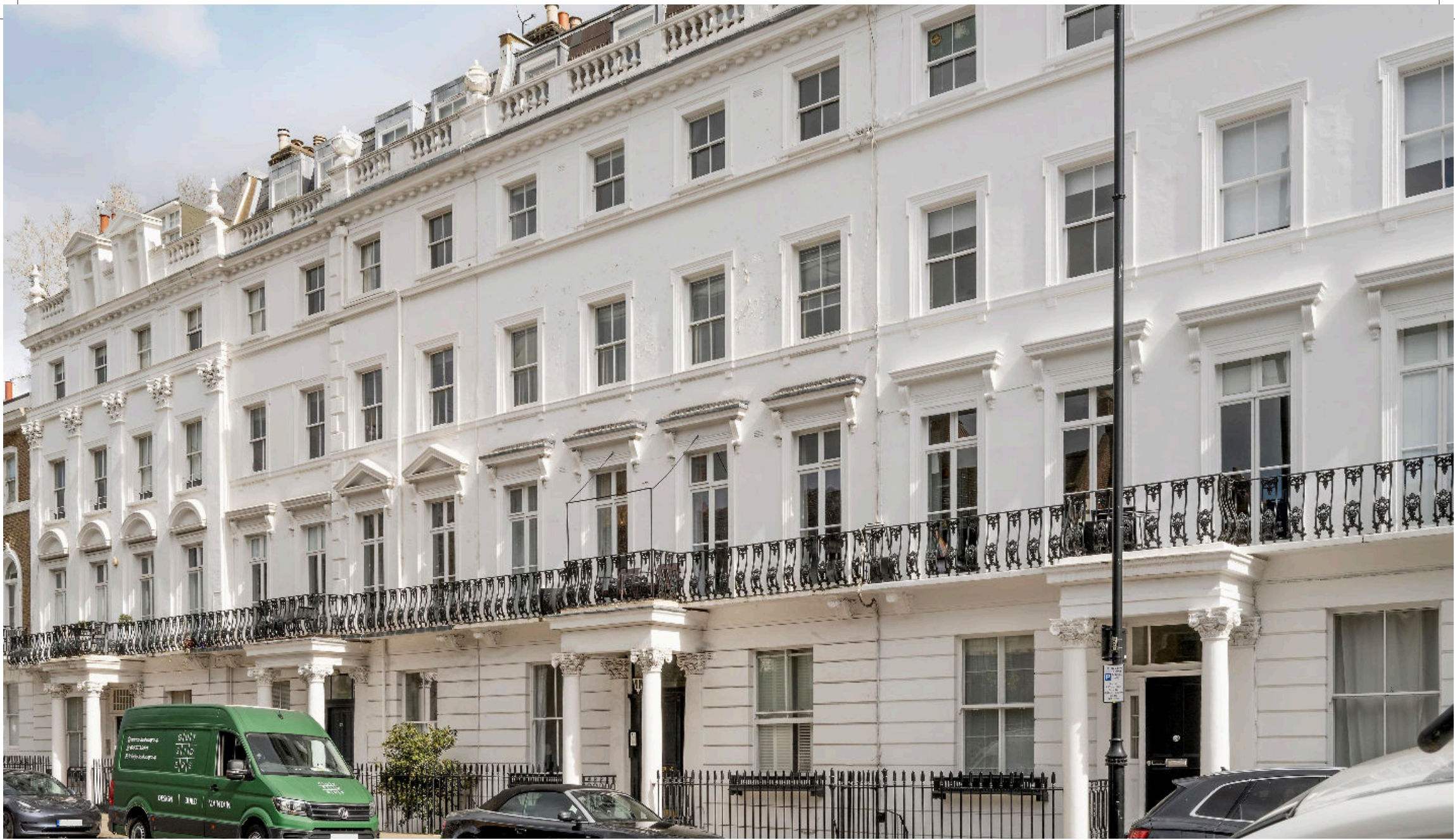
Oakley Street, London SW3