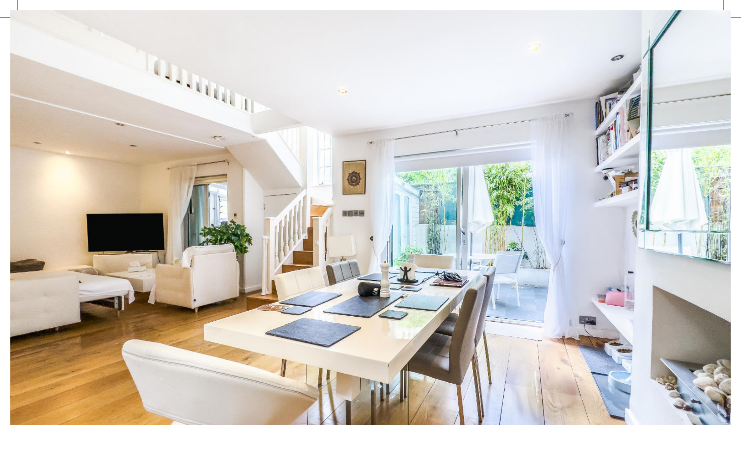
Fernshaw Close, London SW10