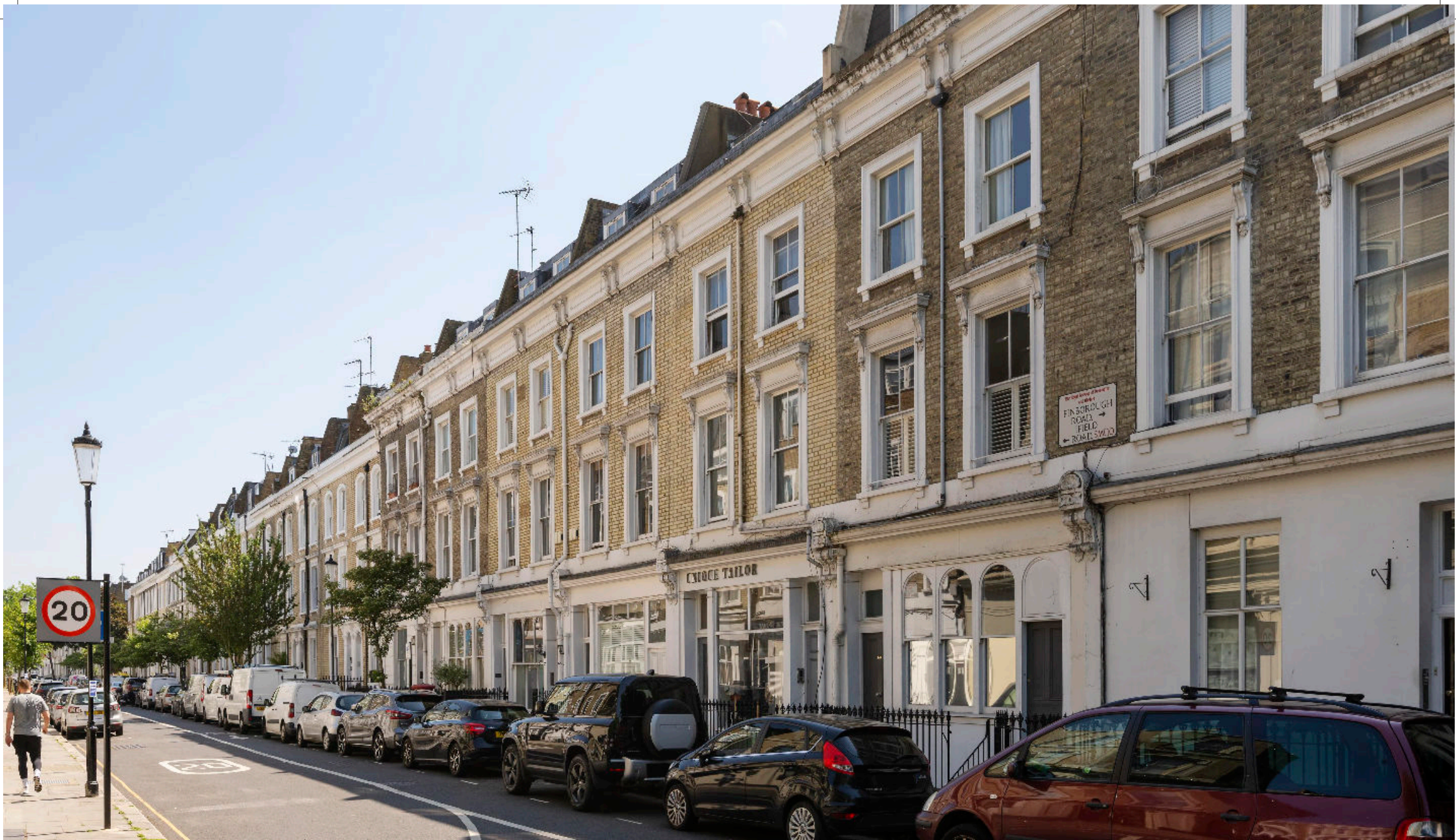
Ifield Road, London SW10