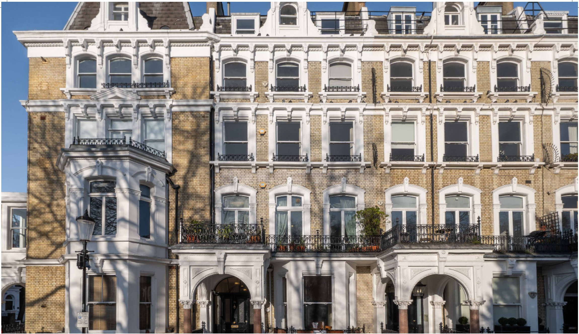
Redcliffe Square, London SW10