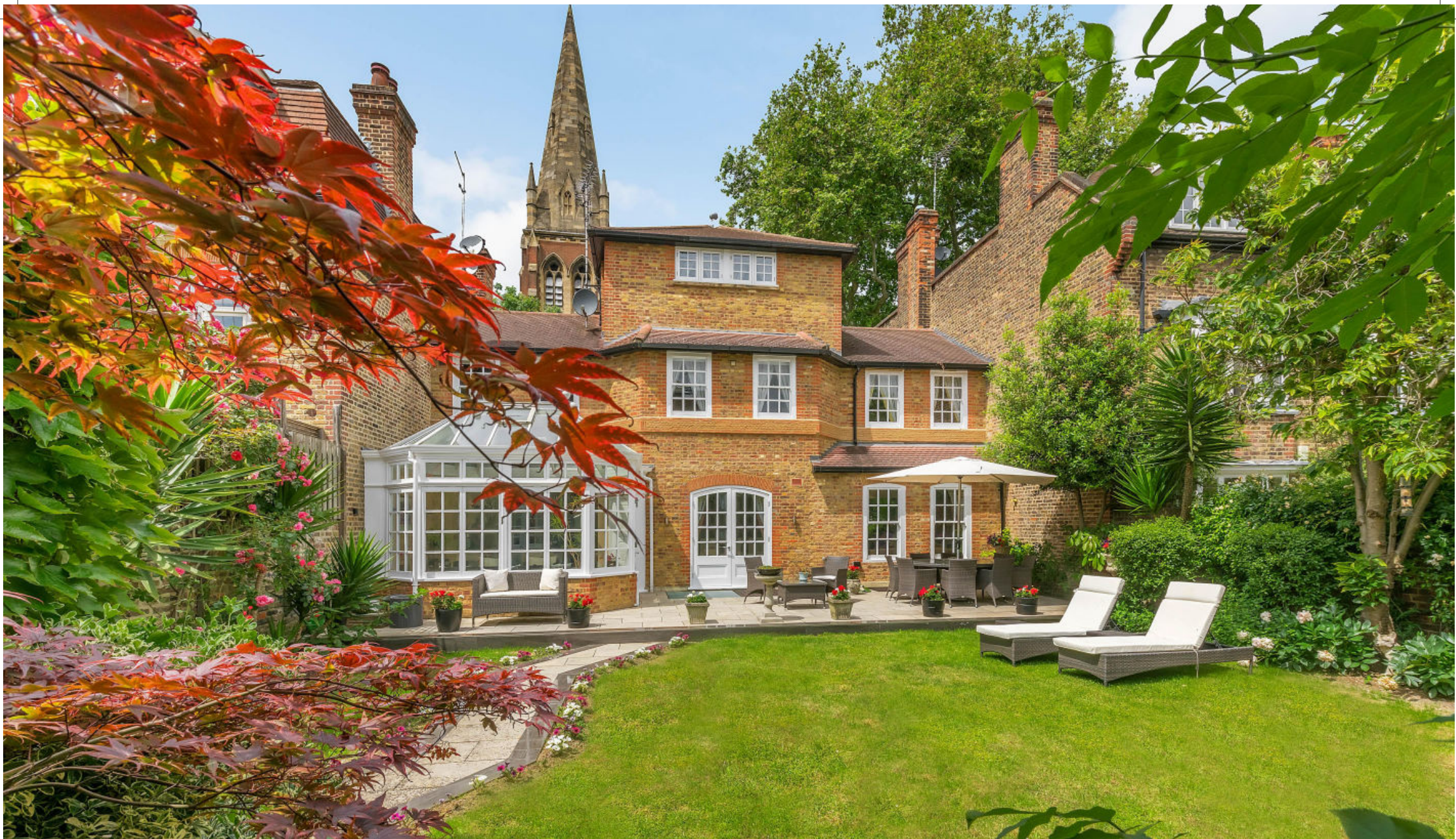
Chelsea Park Gardens, Chelsea SW3