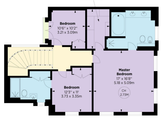
FIRST FLOOR SECOND FLOOR