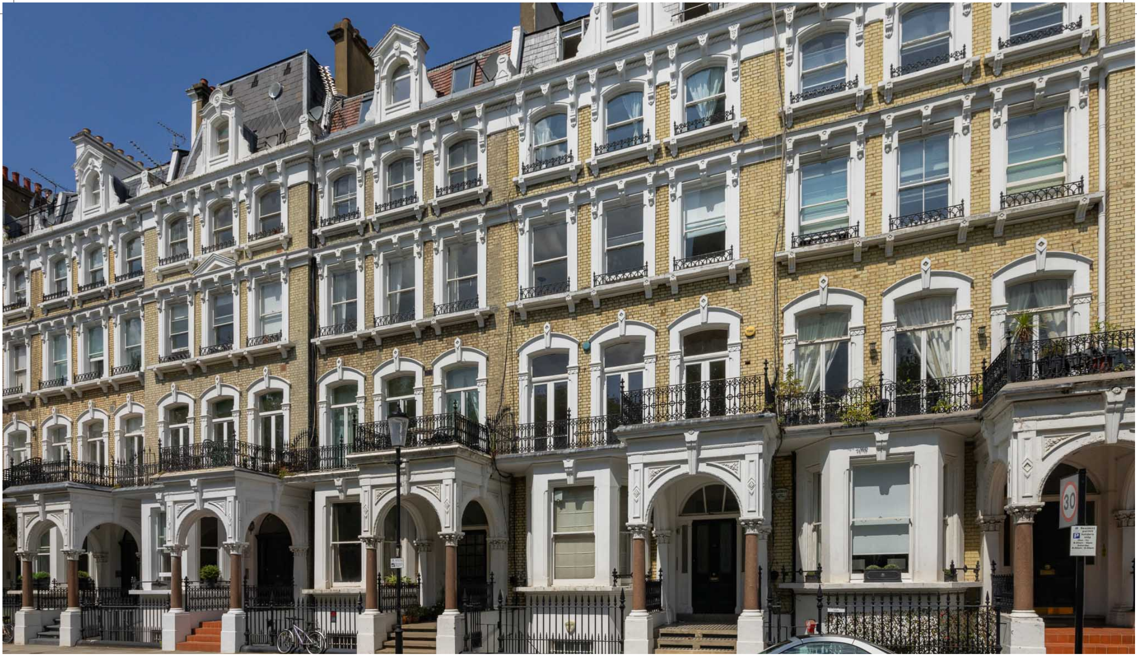
Redcliffe Square, London SW10