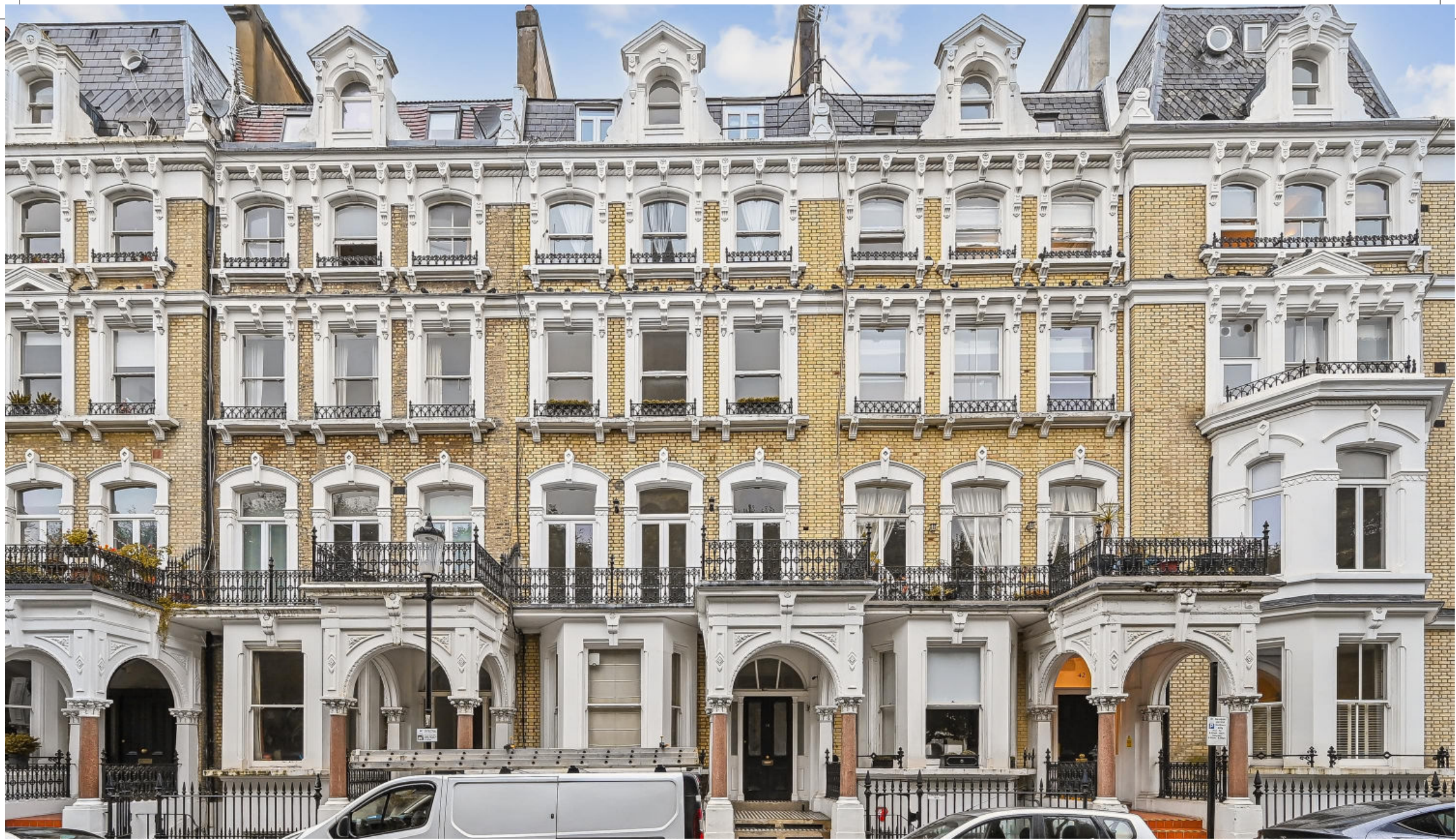
Redcliffe Square, London SW10