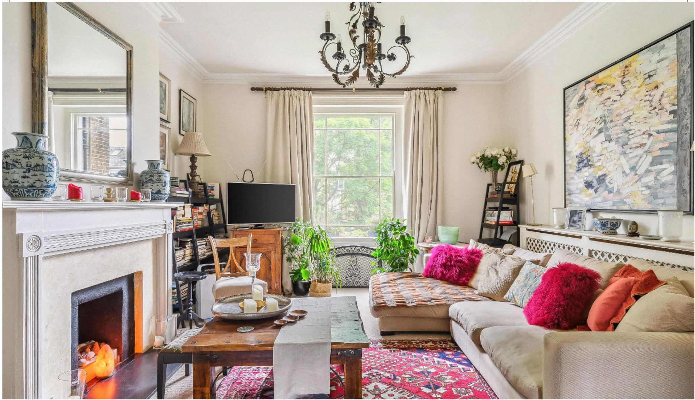
Edith Grove, London SW10