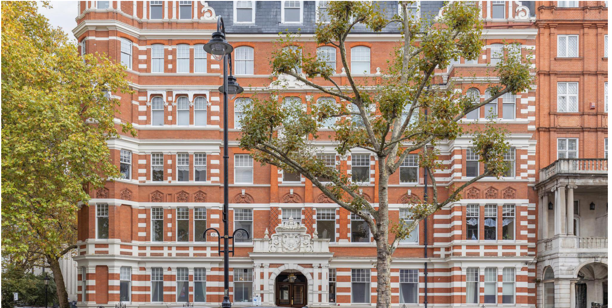
QUEEN'S GATE South Kensington, SW7