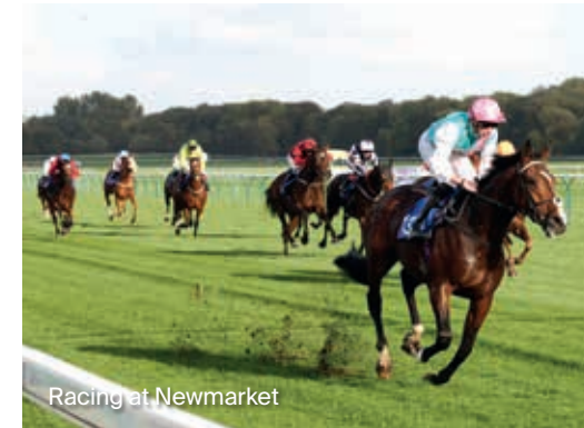
Racing at Newmarket