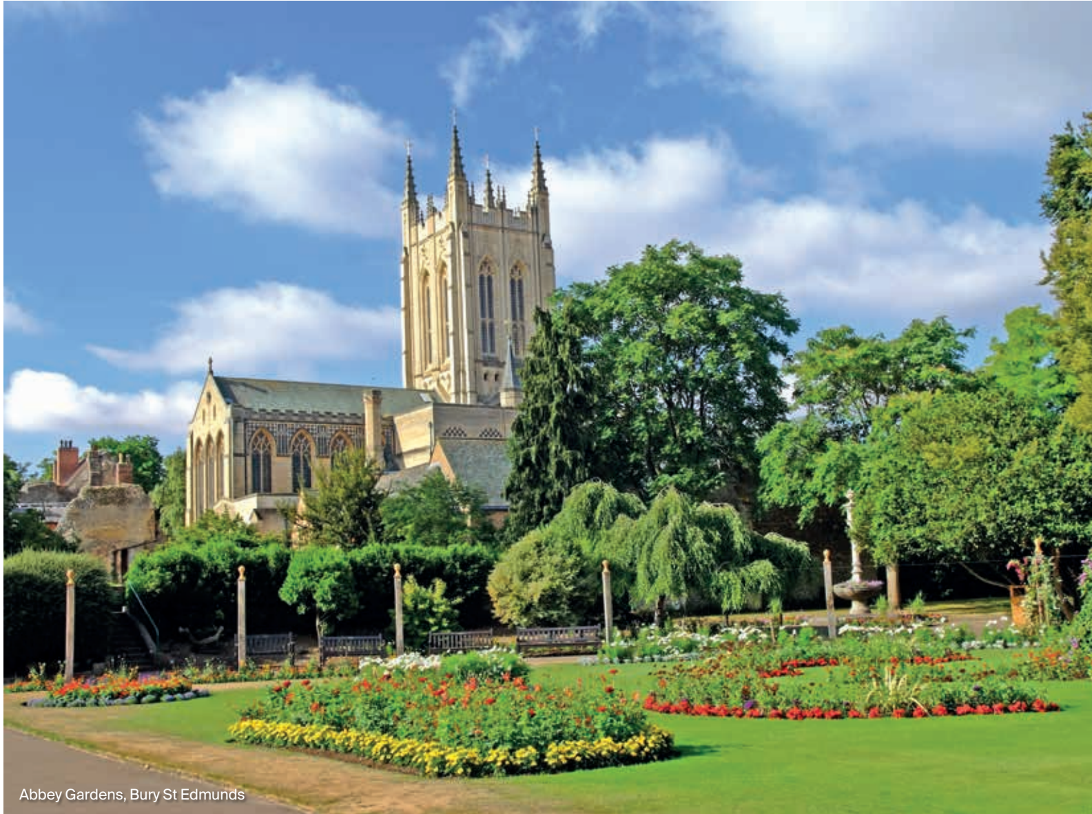
Abbey Gardens, Bury St Edmunds

Thurston House is situated about 1 mile from the village of Thurston and 6 miles east of Bury St Edmunds, the historic market, cathedral town known as the jewel in the crown of Suffolk. Bury St Edmunds is recognised for its history, beautiful outside spaces and great mix of independent and high street shops and for being Suffolk's Foodie Town with its fantastic eateries. The famous racing centre of Newmarket is approximately 20 miles away and the city of Cambridge is 34 miles via the A14, providing excellent shopping, recreational, cultural and educational facilities. London is easily accessible via the M11 and there is a fast train to King's Cross (47 minutes) from Cambridge or to London Liverpool Street from Stowmarket (80 minutes).