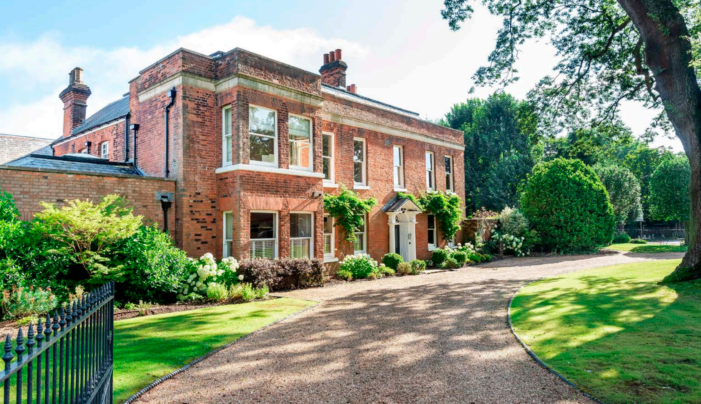
Hadley Bourne House, Monken Hadley, Hertfordshire