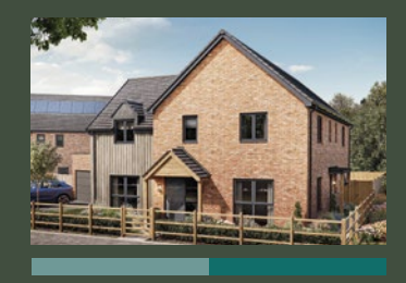
The Badminton 5 bedroom home Plots: 20 & 22