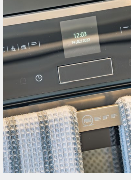
Images depict examples of specification and upgrades from sister developments