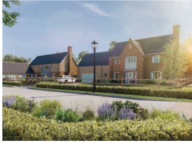
Computer generated image for illustrative purposes only.