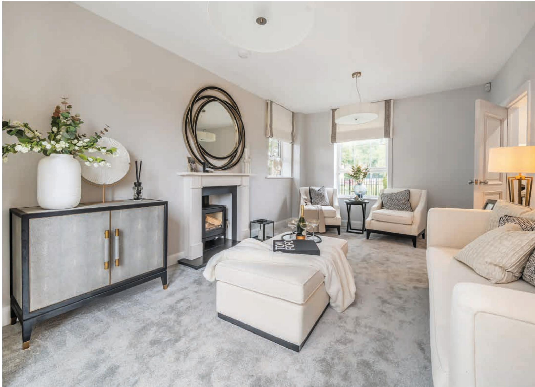
Indicative image of previous Bewley show home.