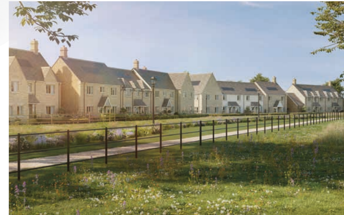
Computer generated image for illustrative purposes only.