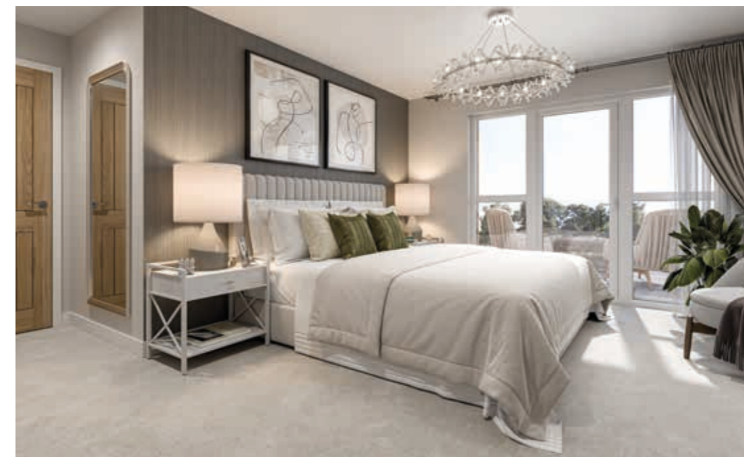
Computer generated interior image.

At Bewley Homes we are proud to be creating homes that will last the test of time.