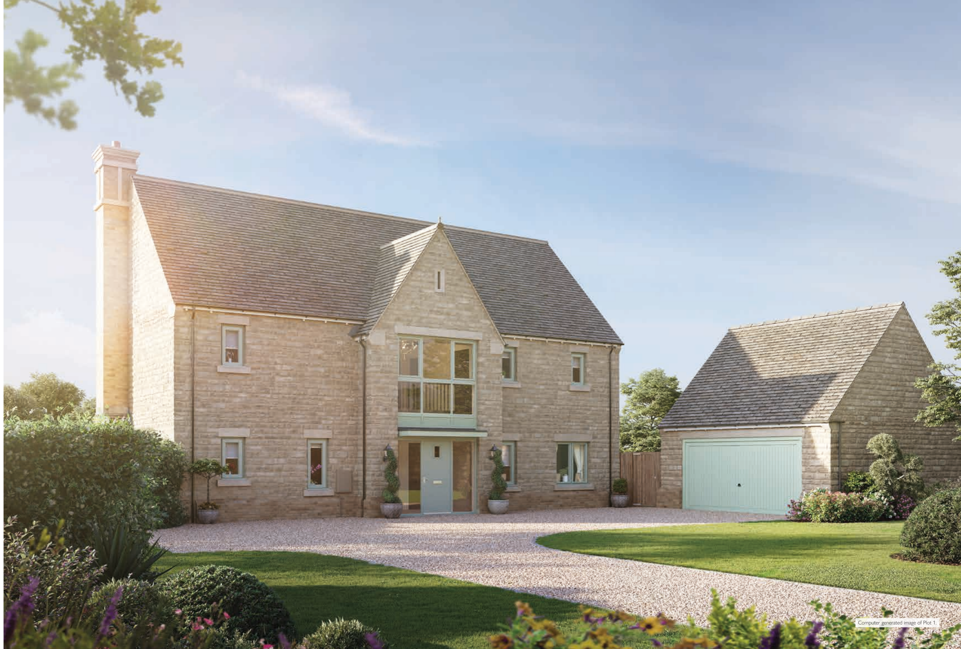
Computer generated image of Plot 1.