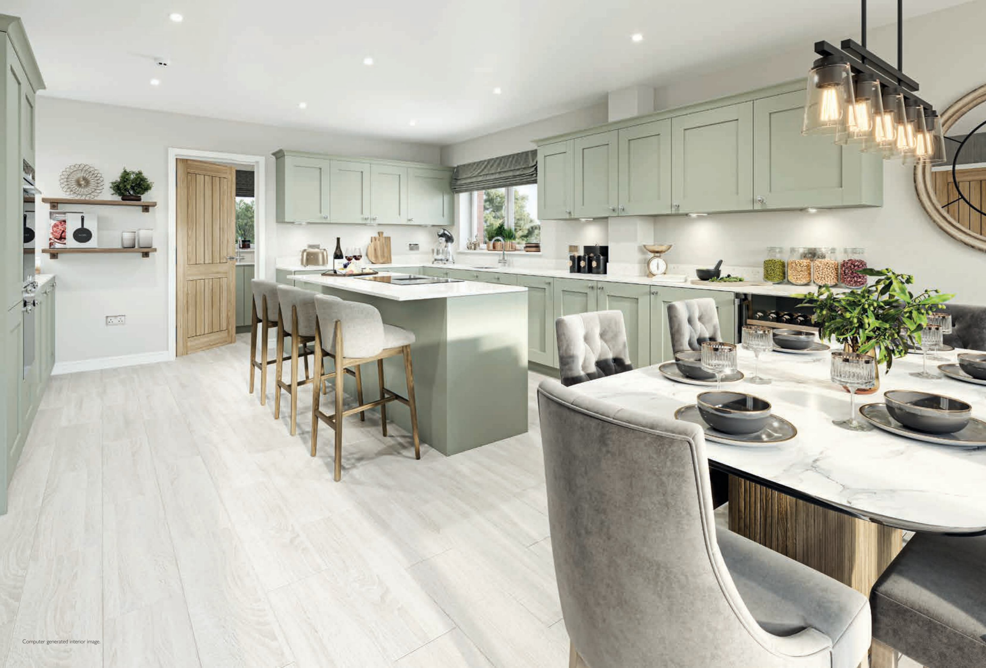
Computer generated interior image.