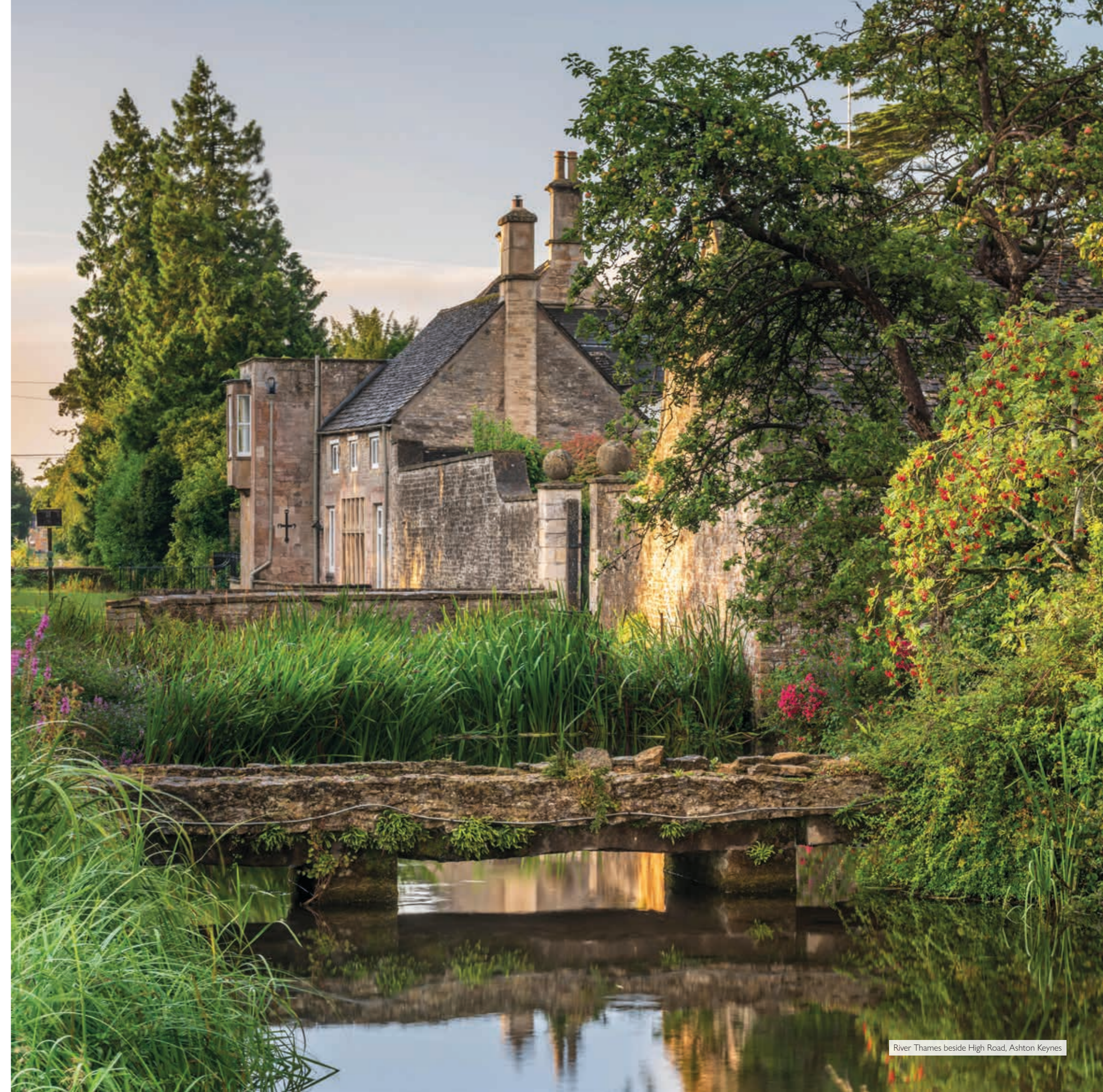
River Thames beside High Road, Ashton Keynes