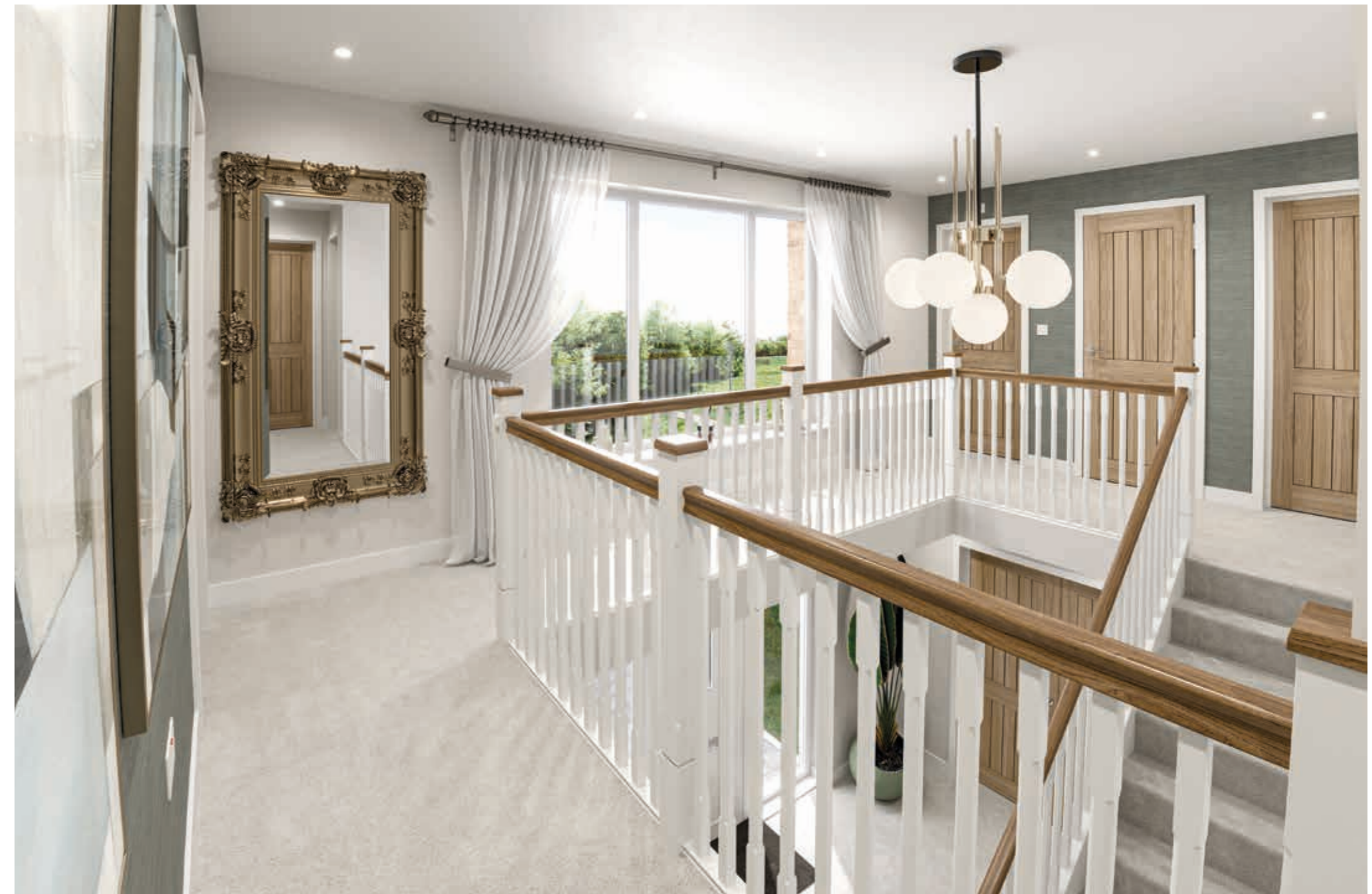
Computer generated interior image.