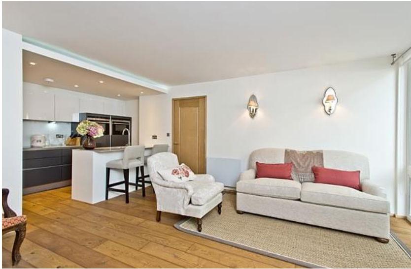
PICTURED Reception room