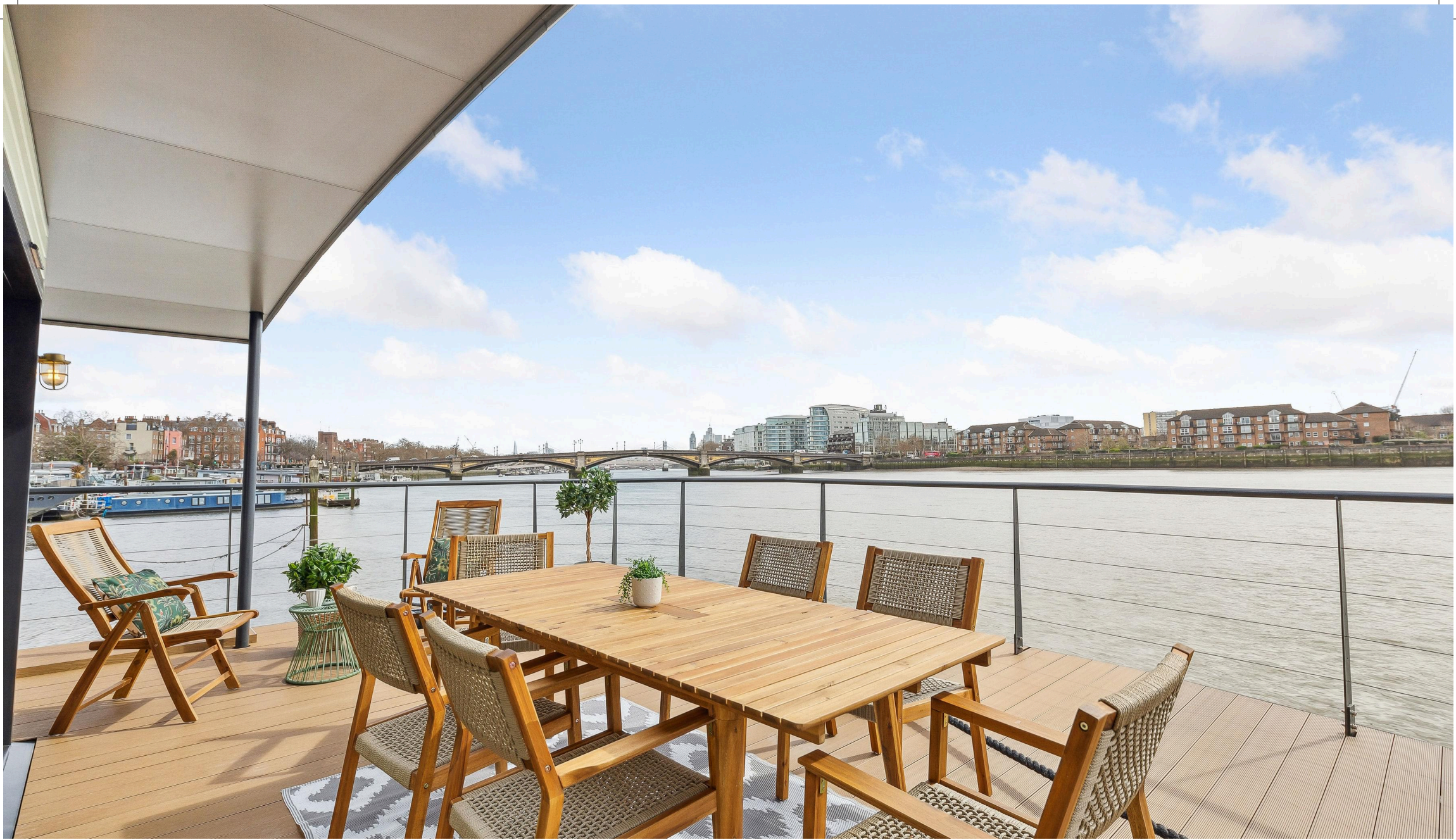
Houseboat Zephyr Riverside, Cheyne Walk SW10