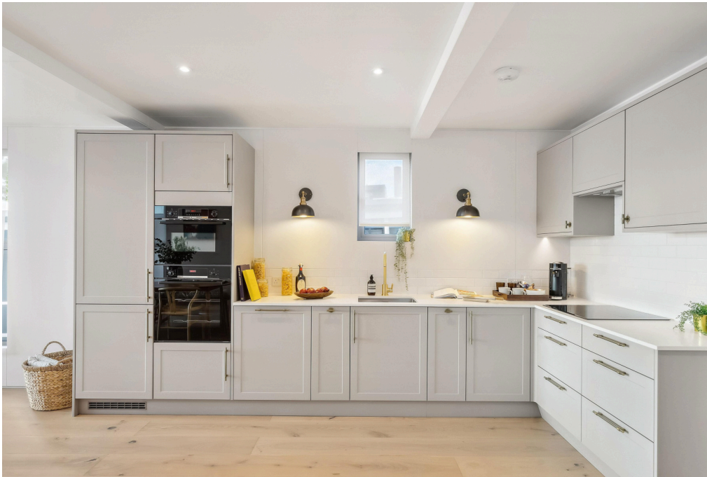
PICTURED BOTTOM Kitchen

The property offers an open plan reception room alongside a fully fitted kitchen that leads seamlessly to the terrace.