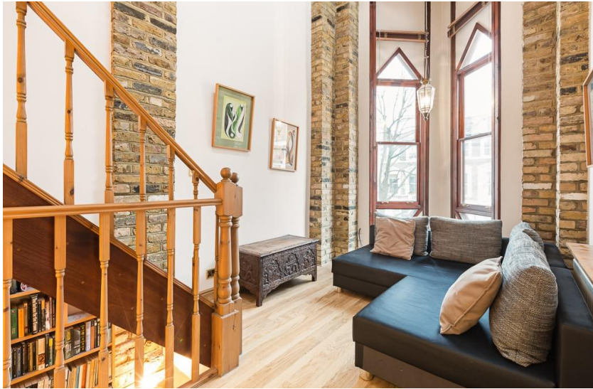
PICTURED Reception room