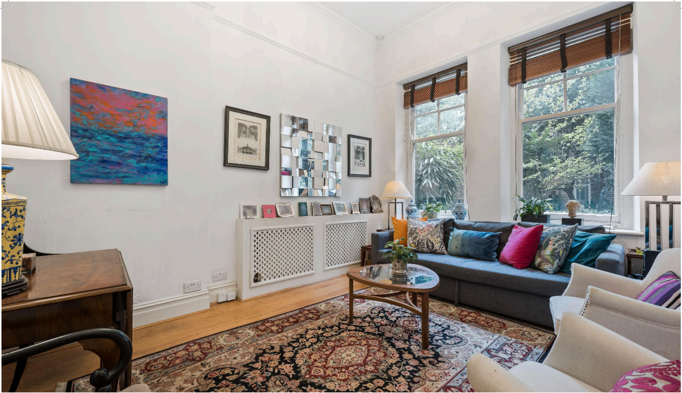
Argyll Mansions, London SW10