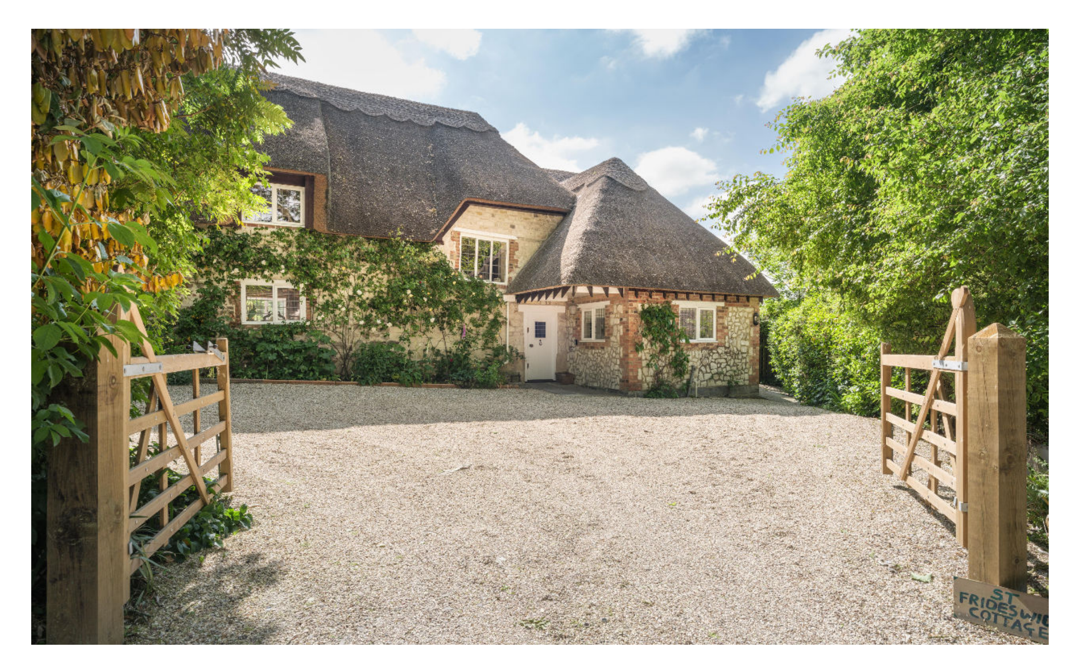
St. Fridewides Cottage, Knighton, Oxfordshire