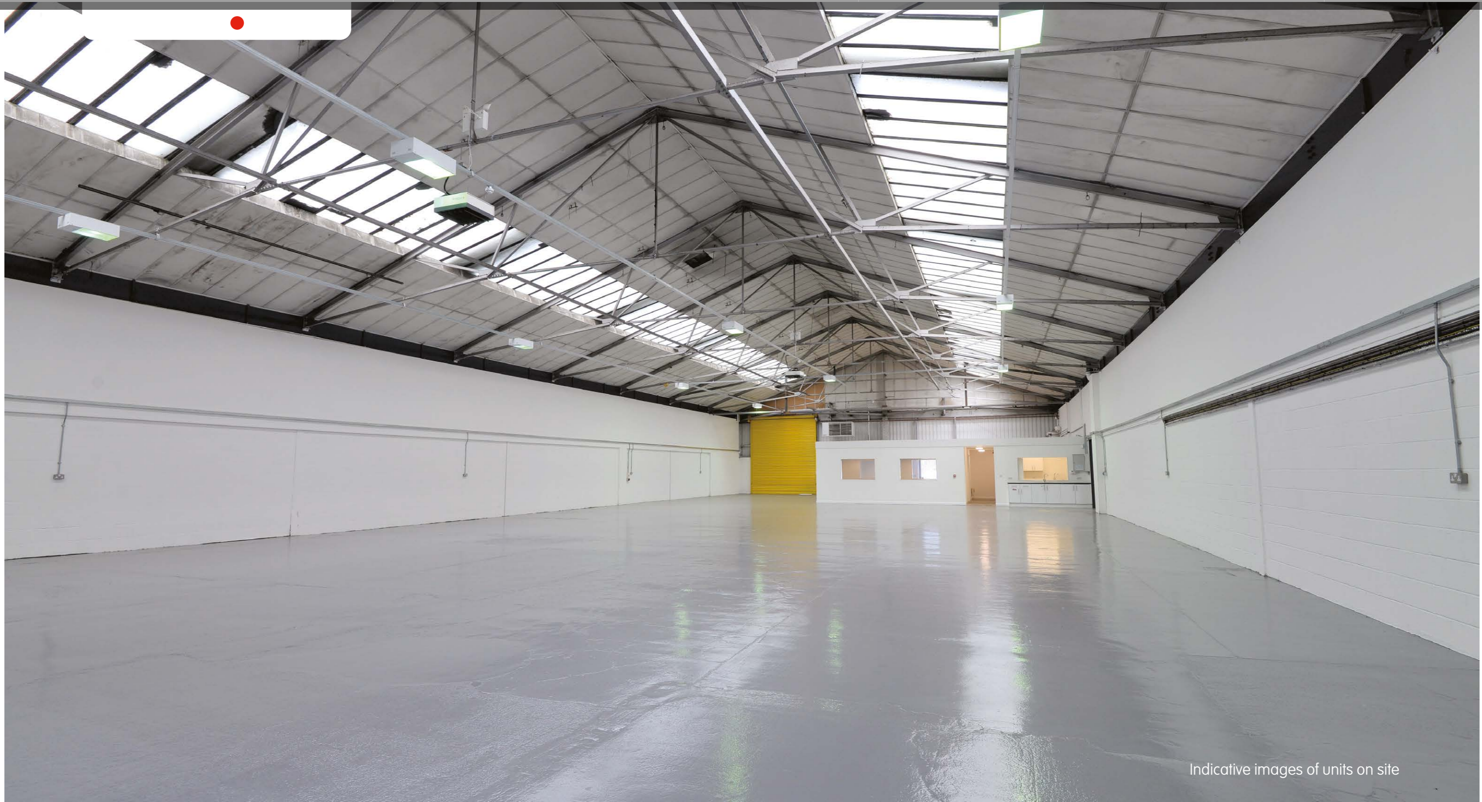
Indicative images of units on site