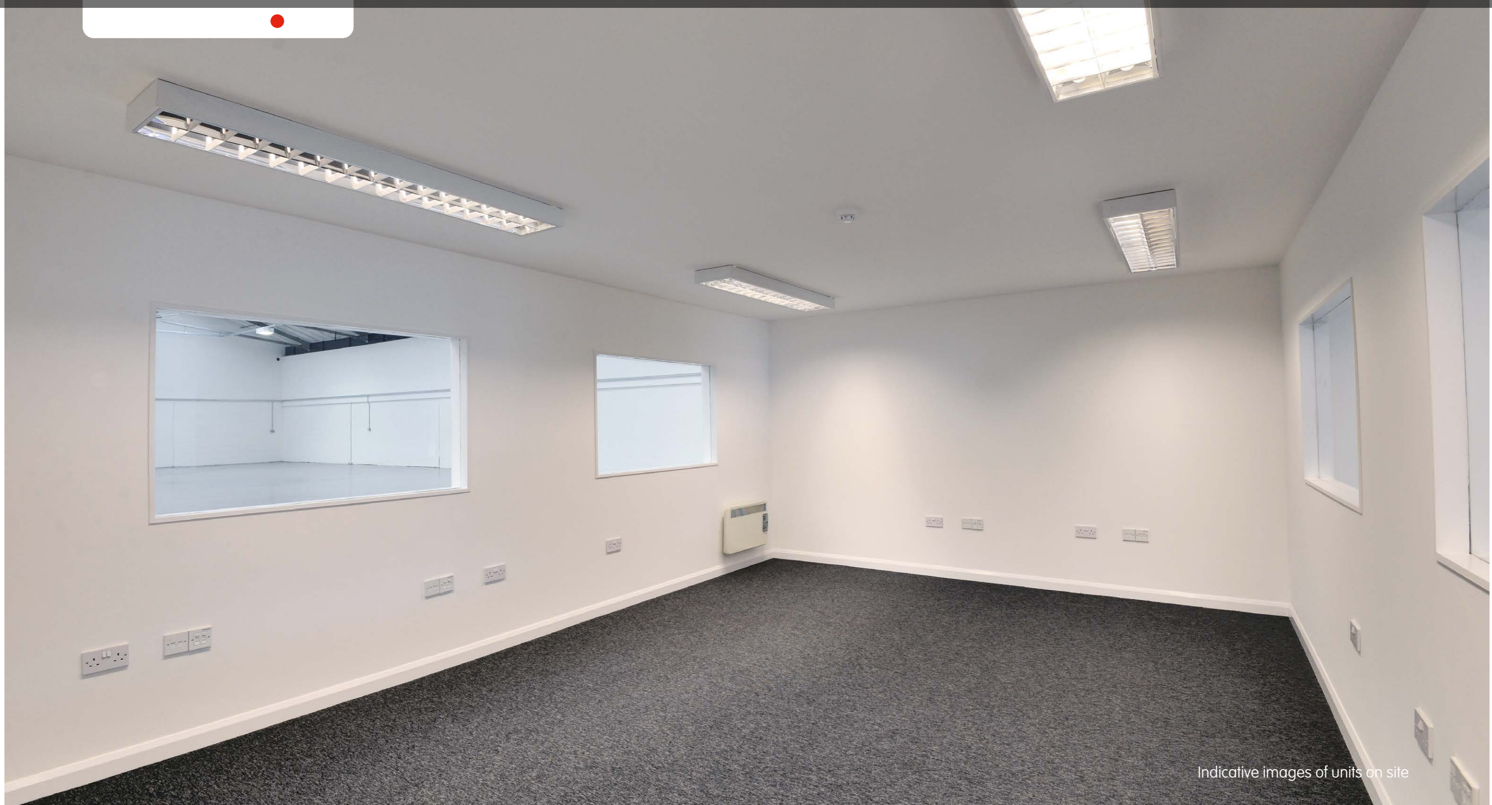
Indicative images of units on site