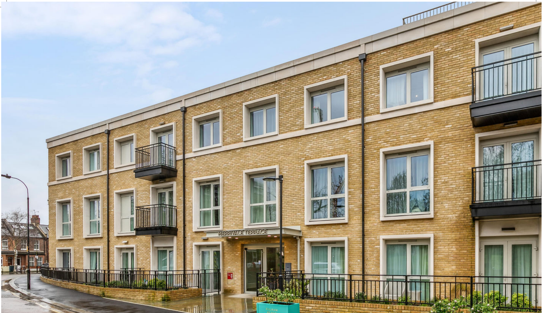
Merrivale Terrace, Distillery Road, London W6