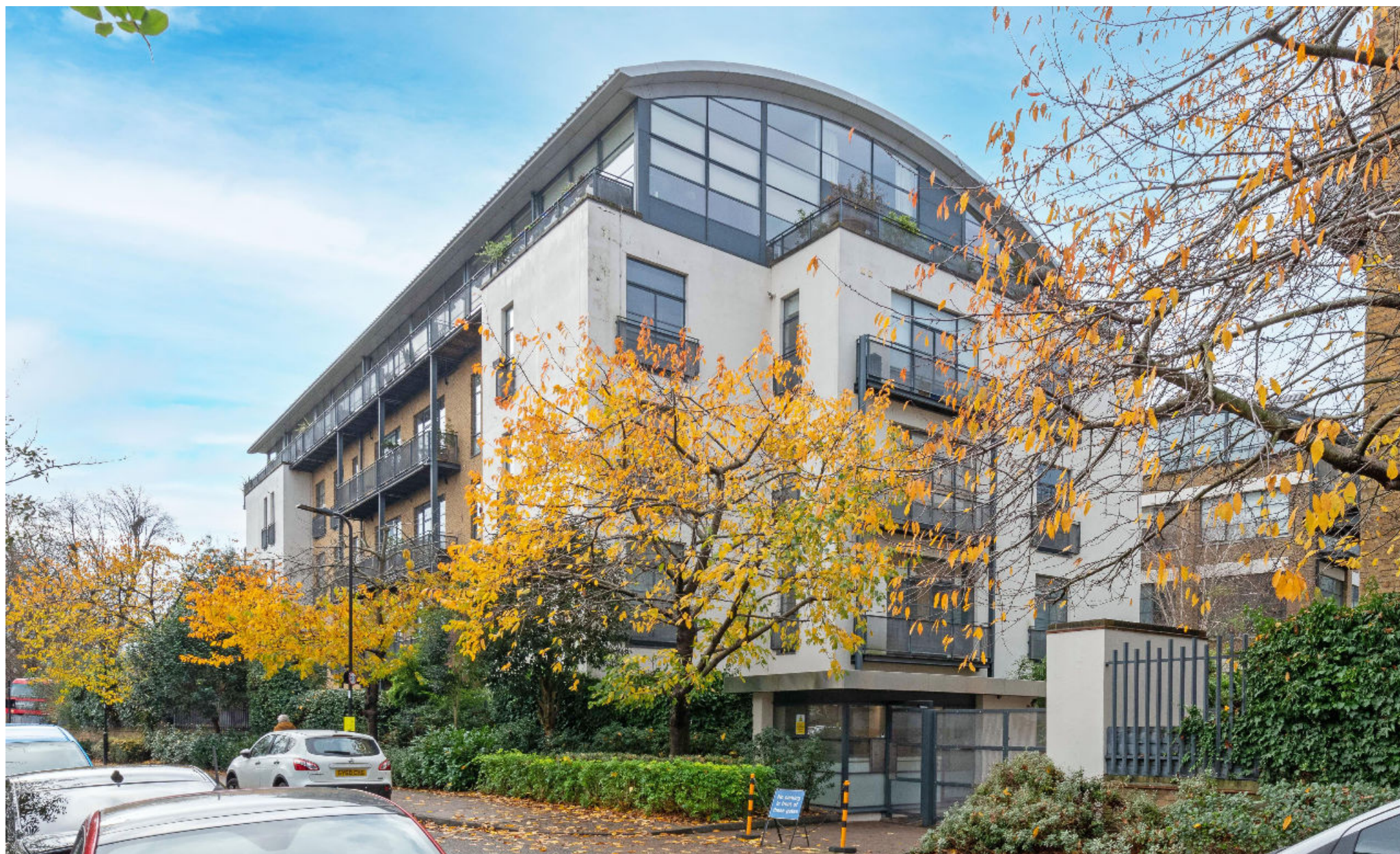
Chiswick Green Studios, Evershed Walk, London W4