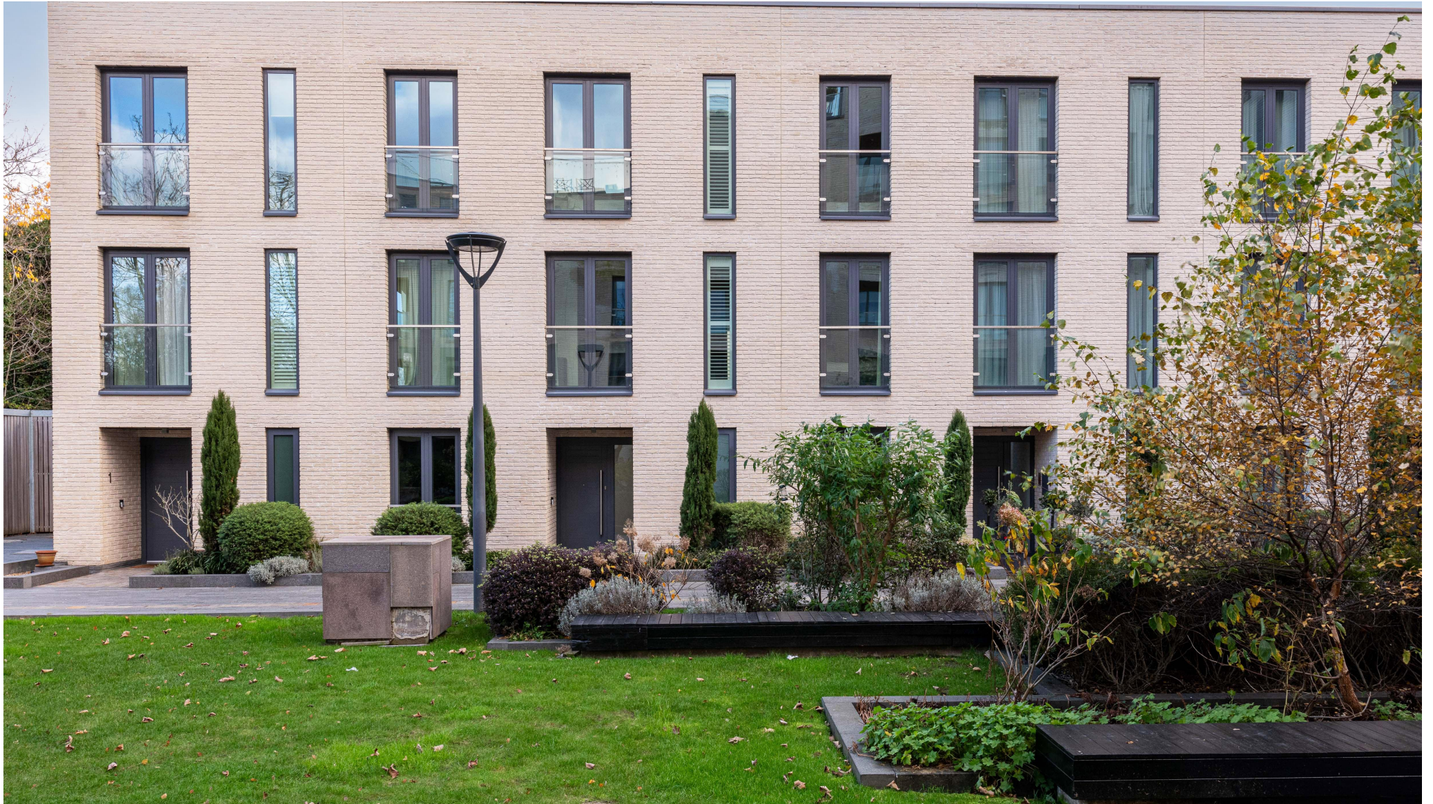
Homebush Terrace, Chiswick W4