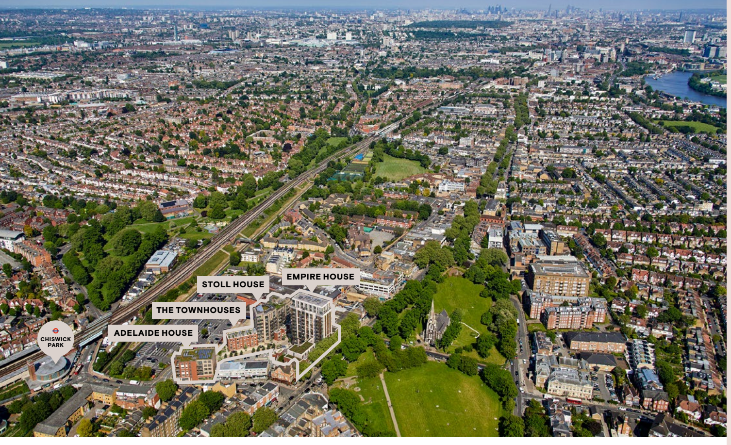
Directly to the south lies the open space of Turnham Creen.