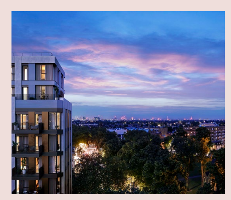
Overlooking Turnham Green, four spacious penthouses adorn the top floors of Empire House with wraparound terraces.

Tucked behind Chiswick High Road, an exclusive terrace of four contemporary family homes provides flexible living arranged over three storeys, with private roof gardens and car parking.