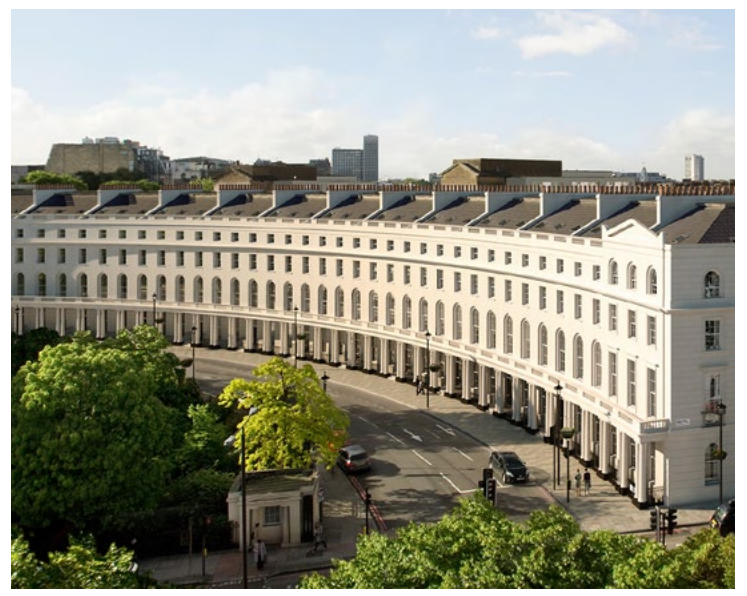
Regent's Crescent, London W1.