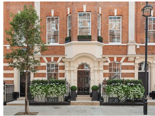
Langham Street, London W1.