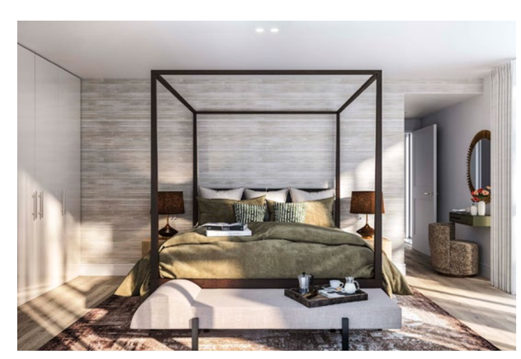
A calming palette accentuates the natural light.