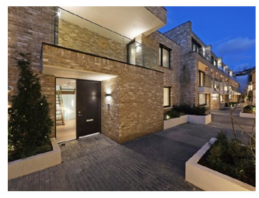
West Village, Notting Hill W11.