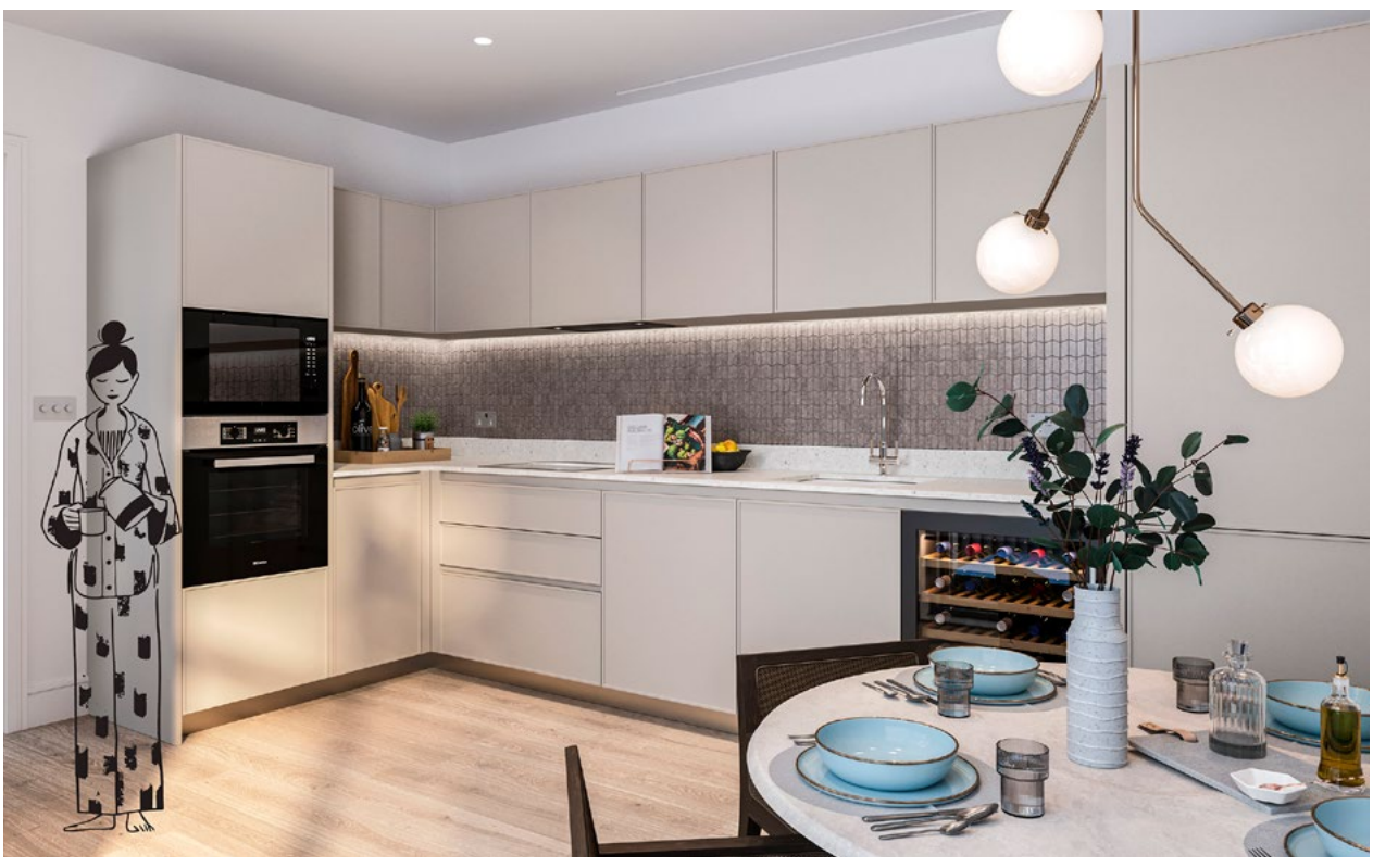
Kitchen cabinetry in a matt lacquer finish with soft closing doors and drawers and integrated Miele appliances.