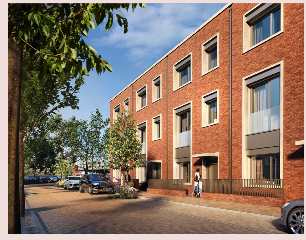
Between the apartment buildings are four family townhouses