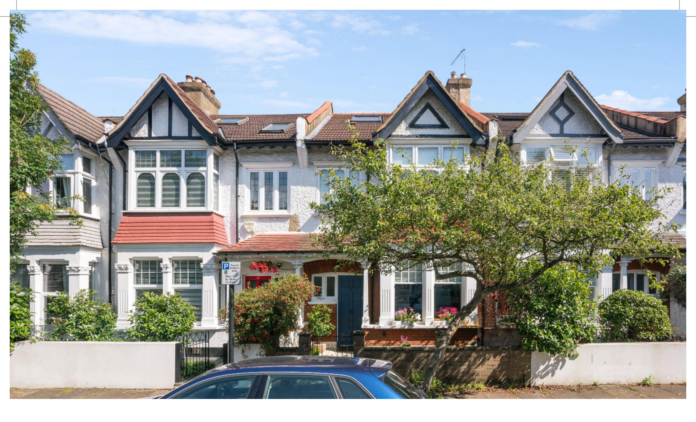
Hamilton Road, London W4