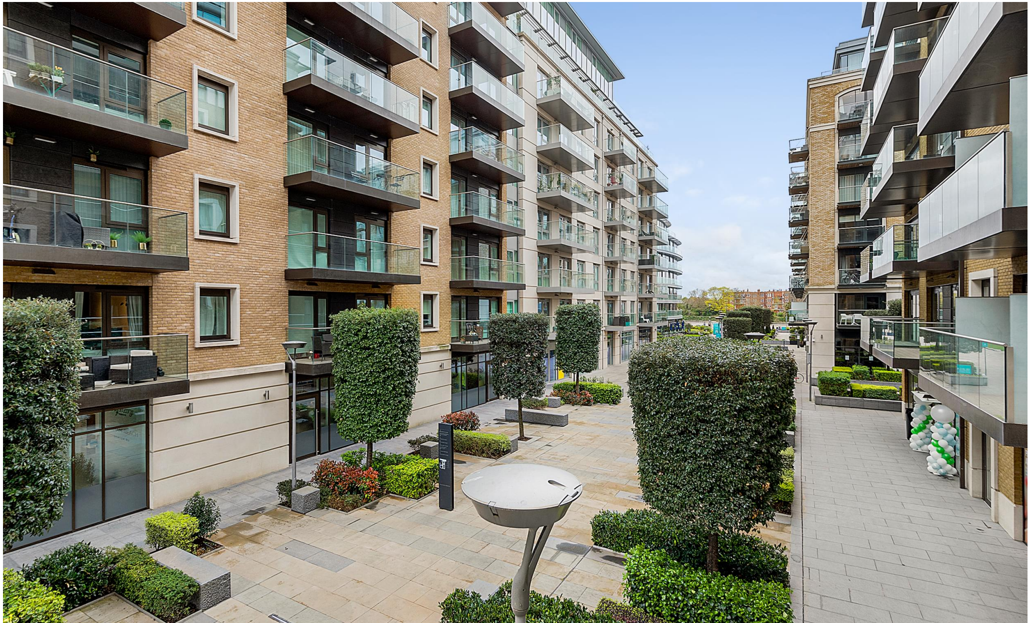
Brunswick House, Parr's Way, London W6