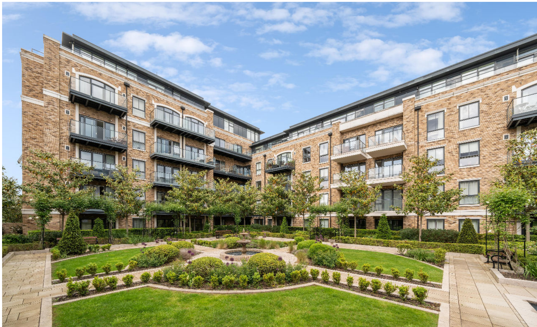
Renaissance Square Apartments, London W4