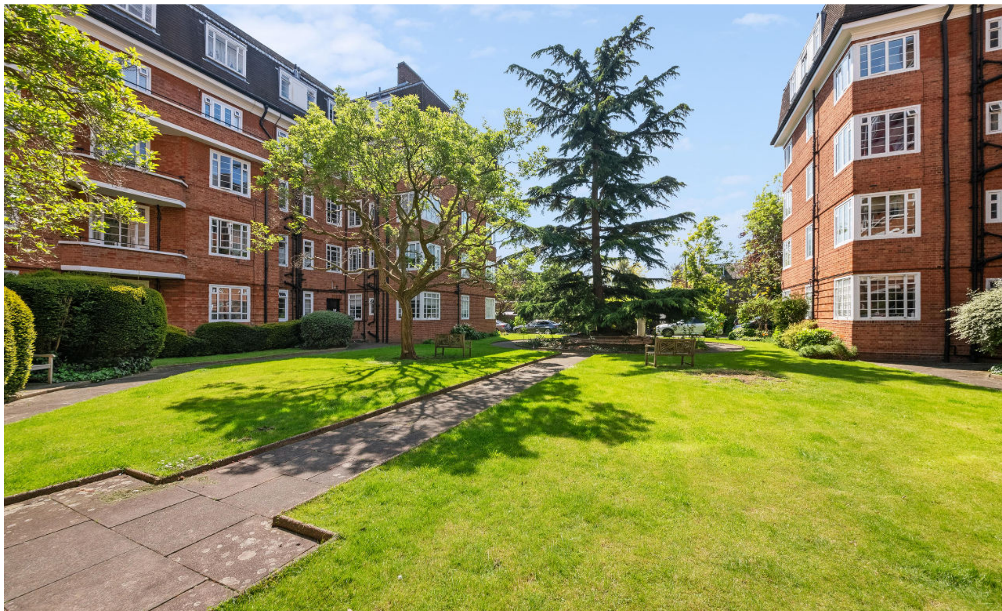
Ascot House, Sutton Court Road W4