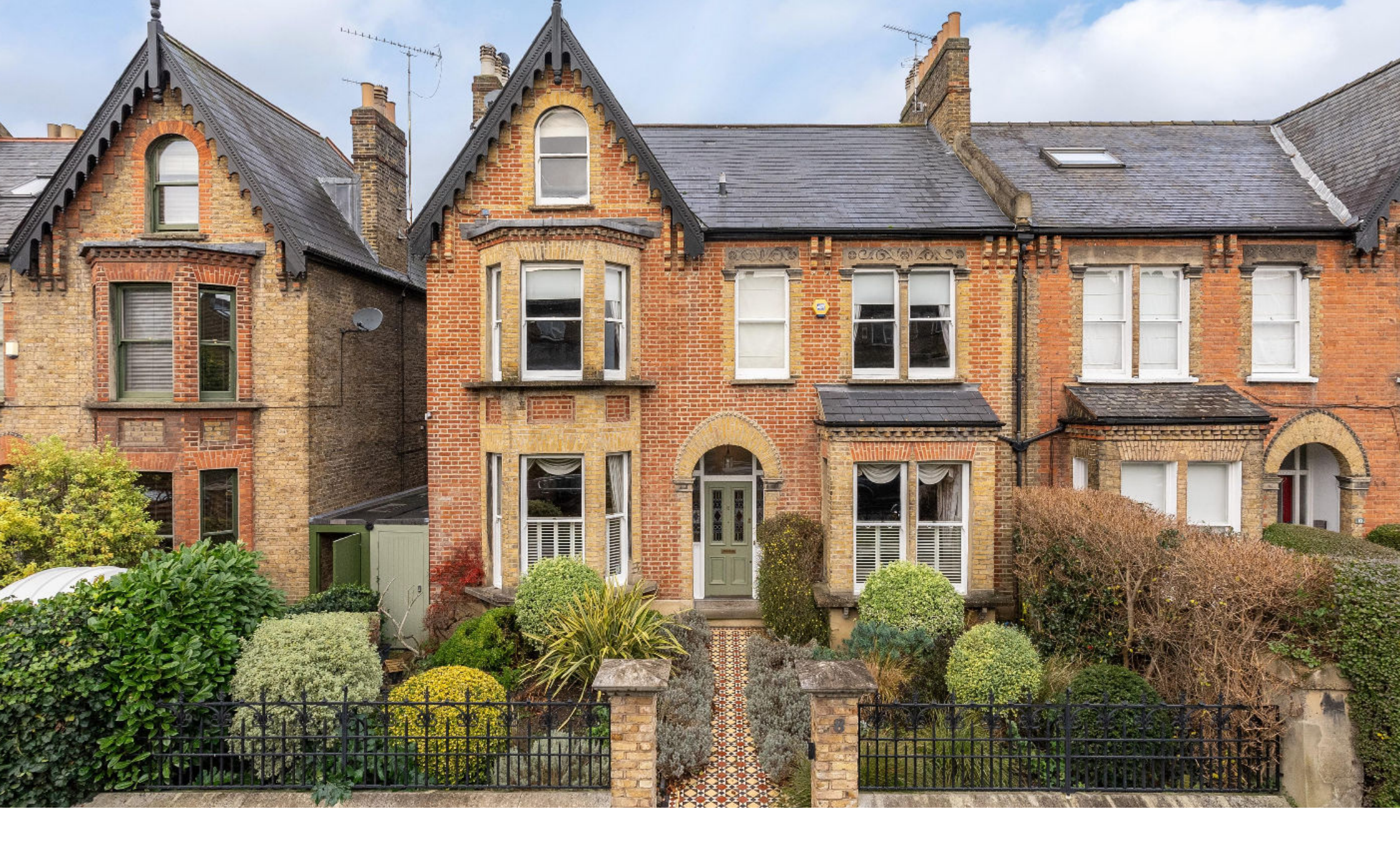
Mundania Road, East Dulwich SE22