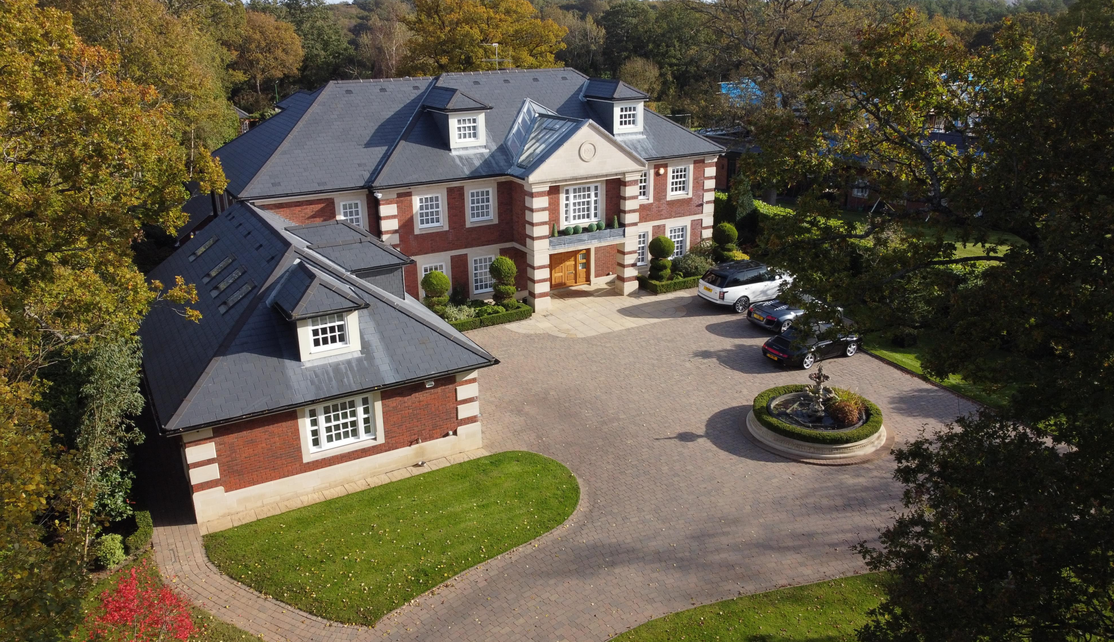
Patchesham Park, Leatherhead