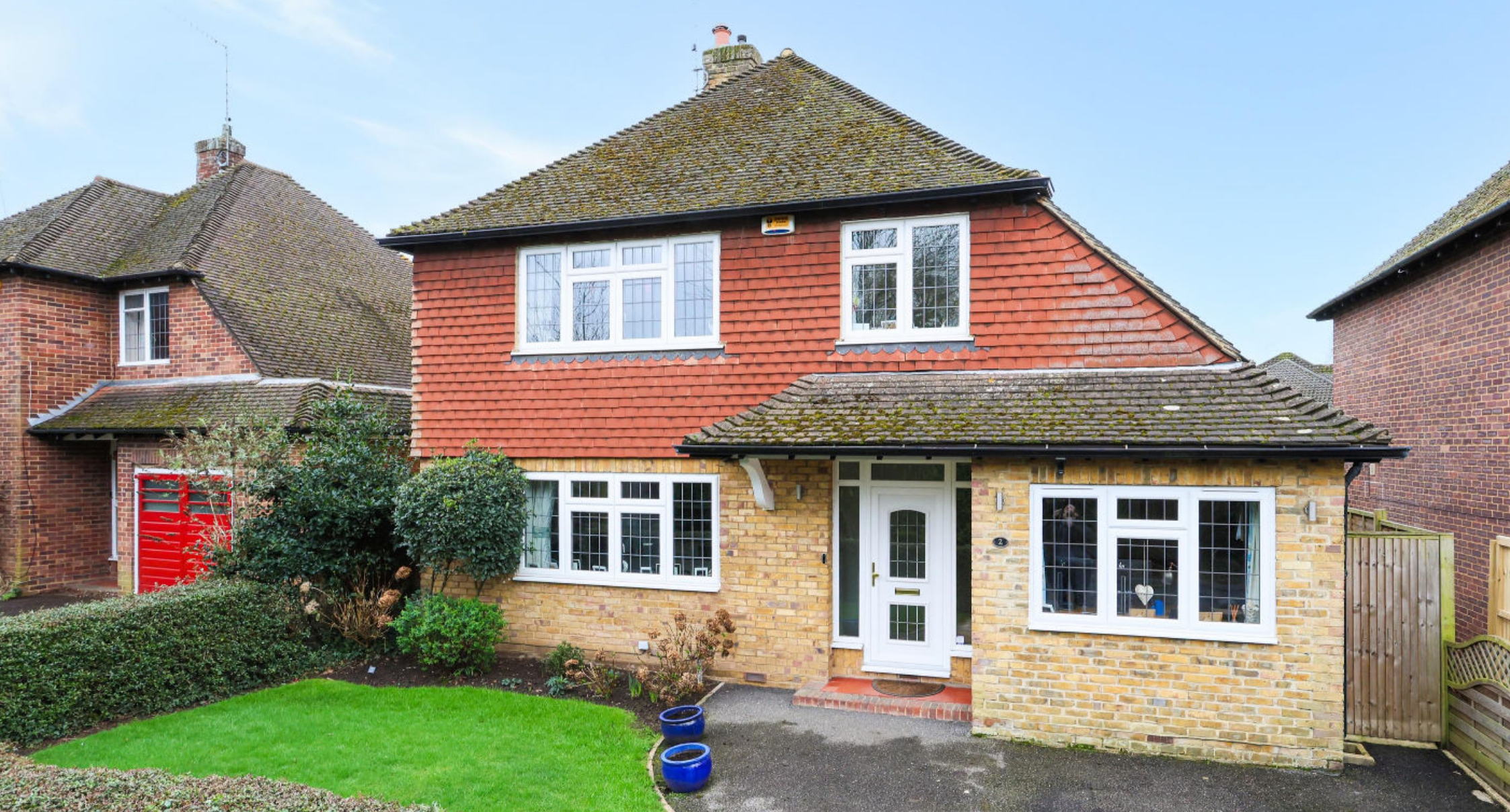
Hermitage Close, Esher