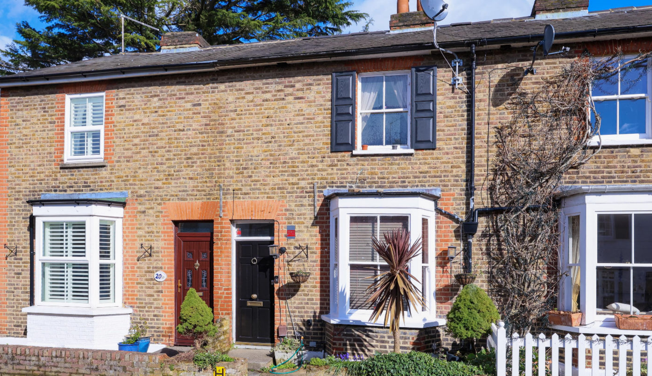
Park Road, Esher