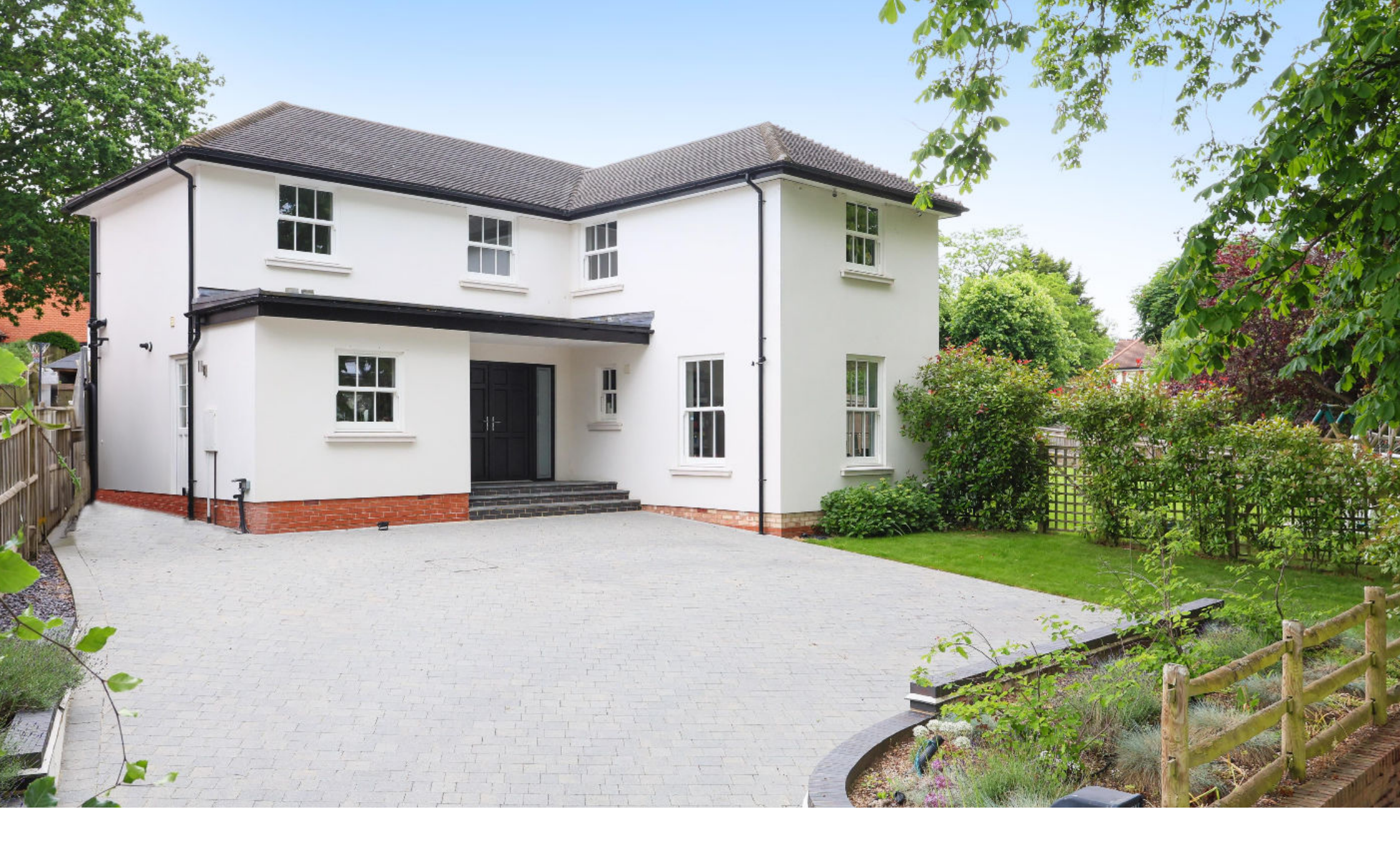
Foley Road, Claygate, KT10