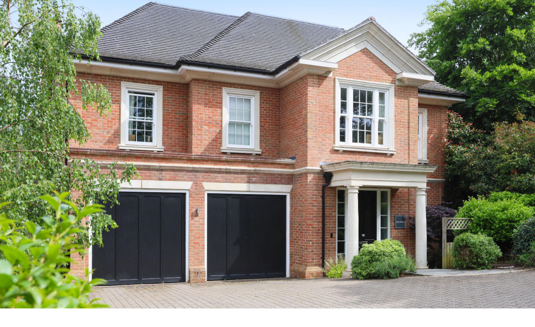
Ruxley Ridge, Claygate KT10