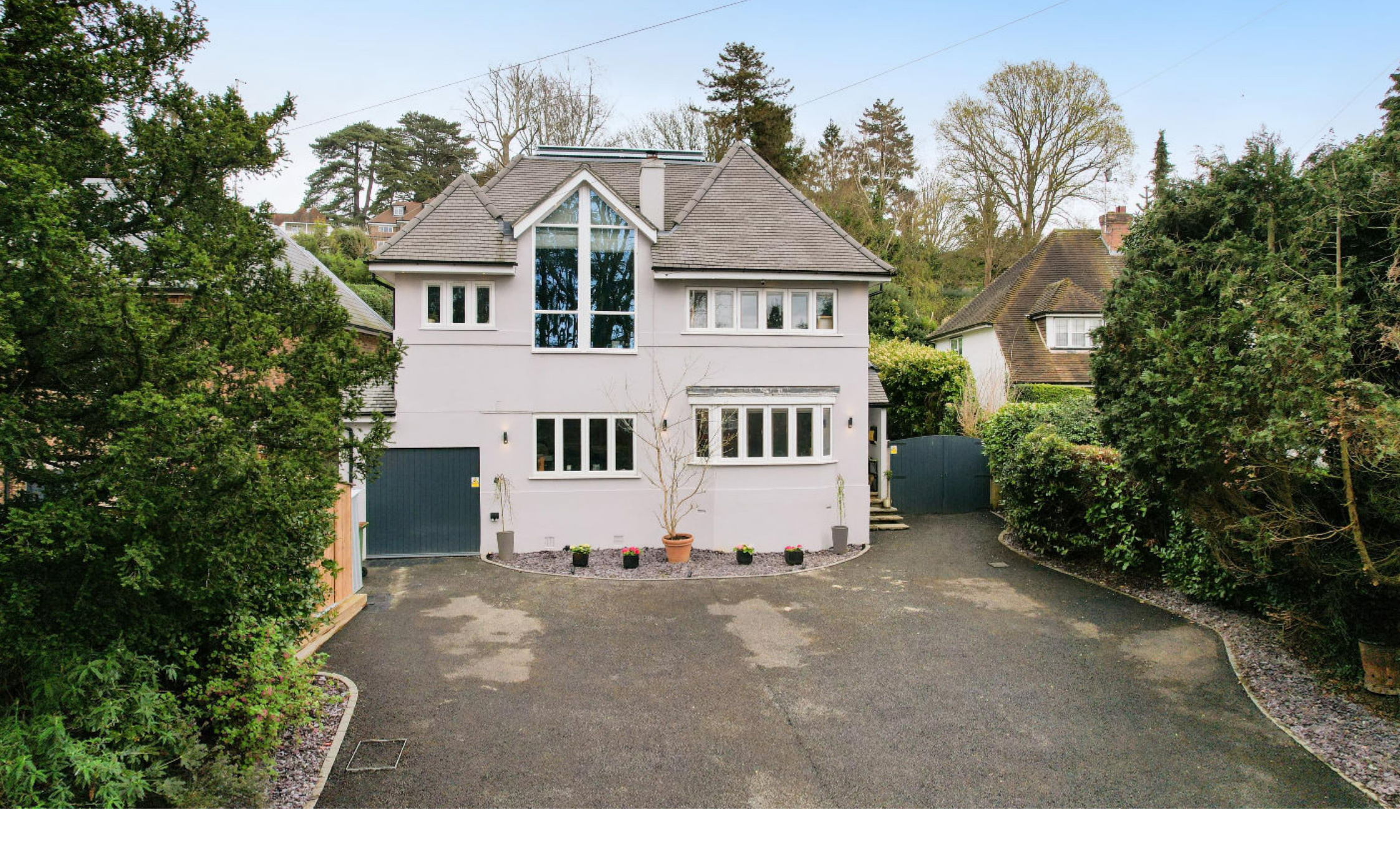
Drakes Close, Esher KT10