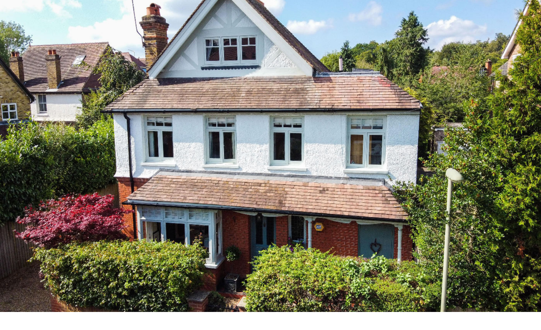
Hillbrow Road, Esher