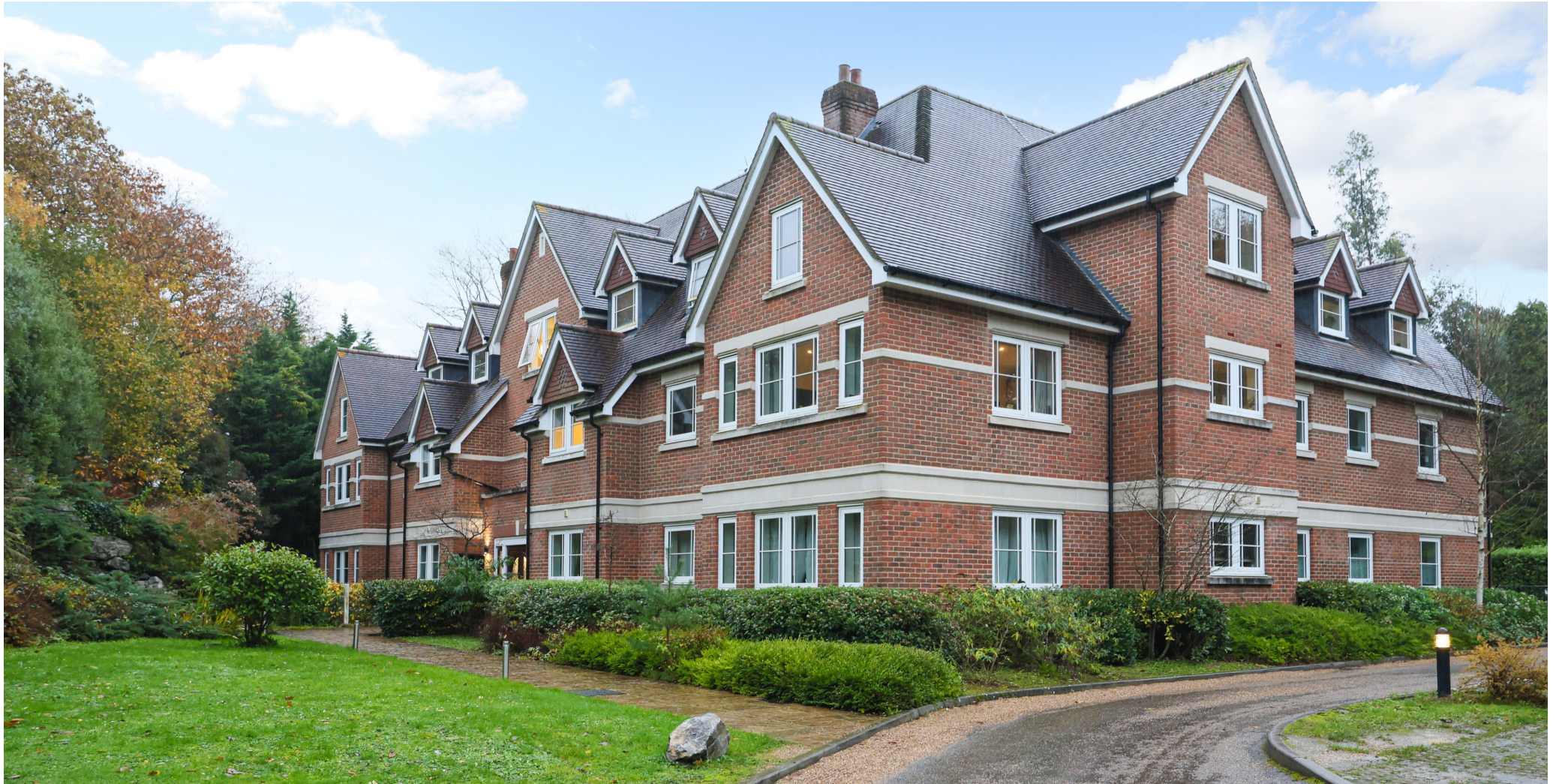
LAKEWOOD, Esher KT10