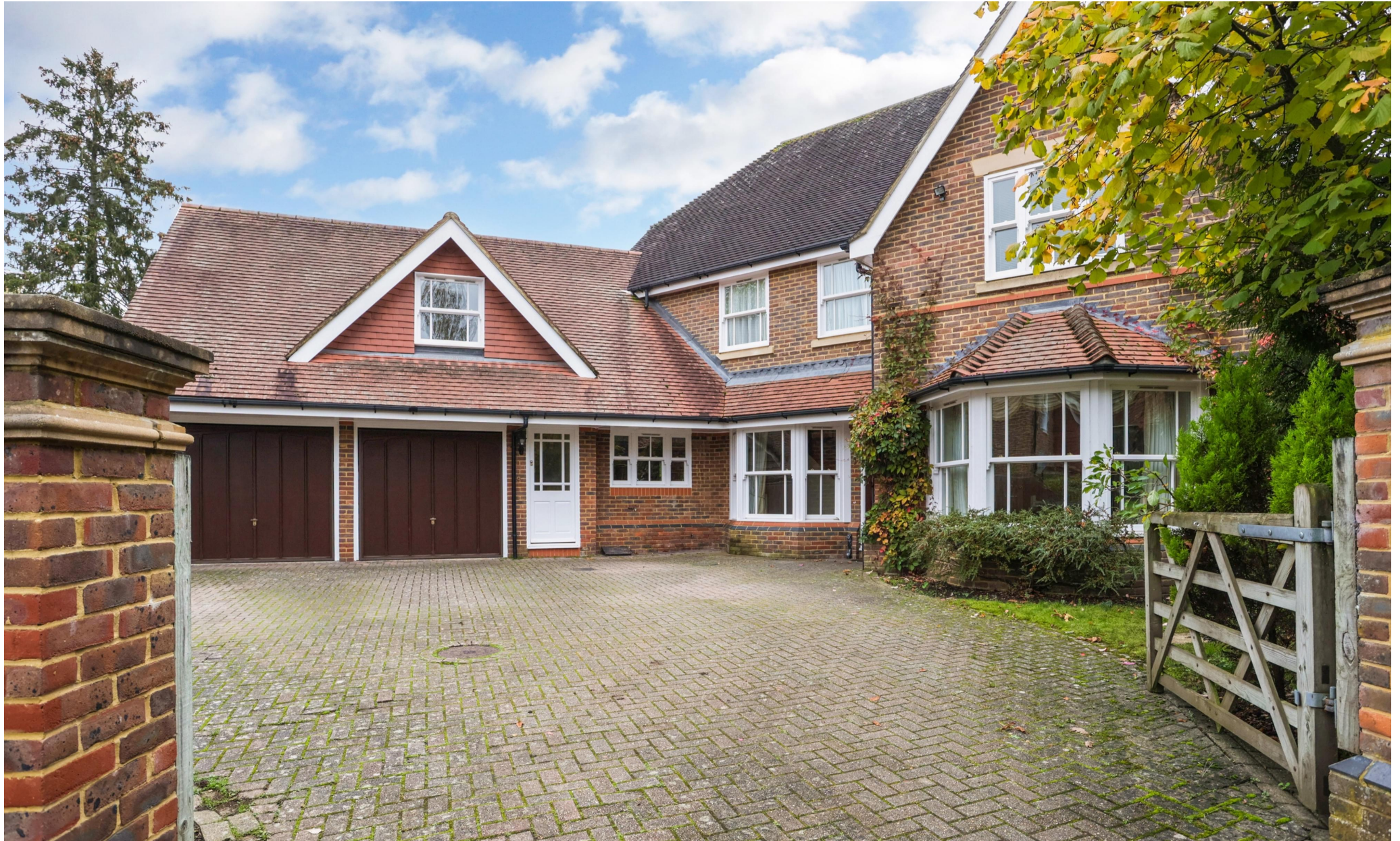
Sandringham Park, Cobham, KT11