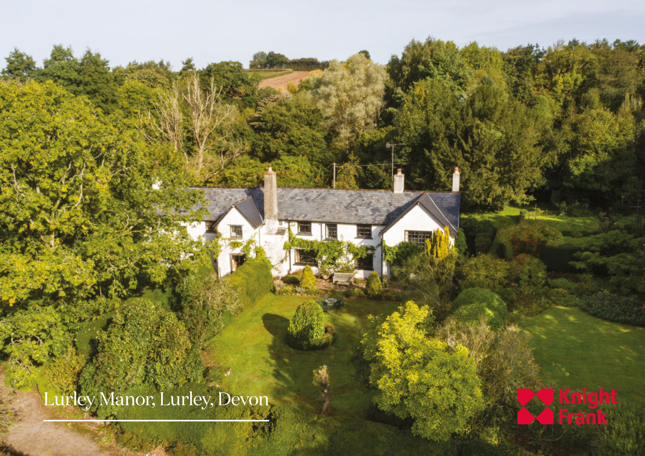
Lurley Manor, Lurley, Devon