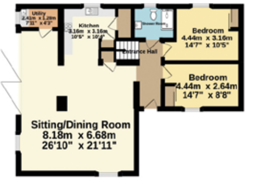
Cottage Ground Floor